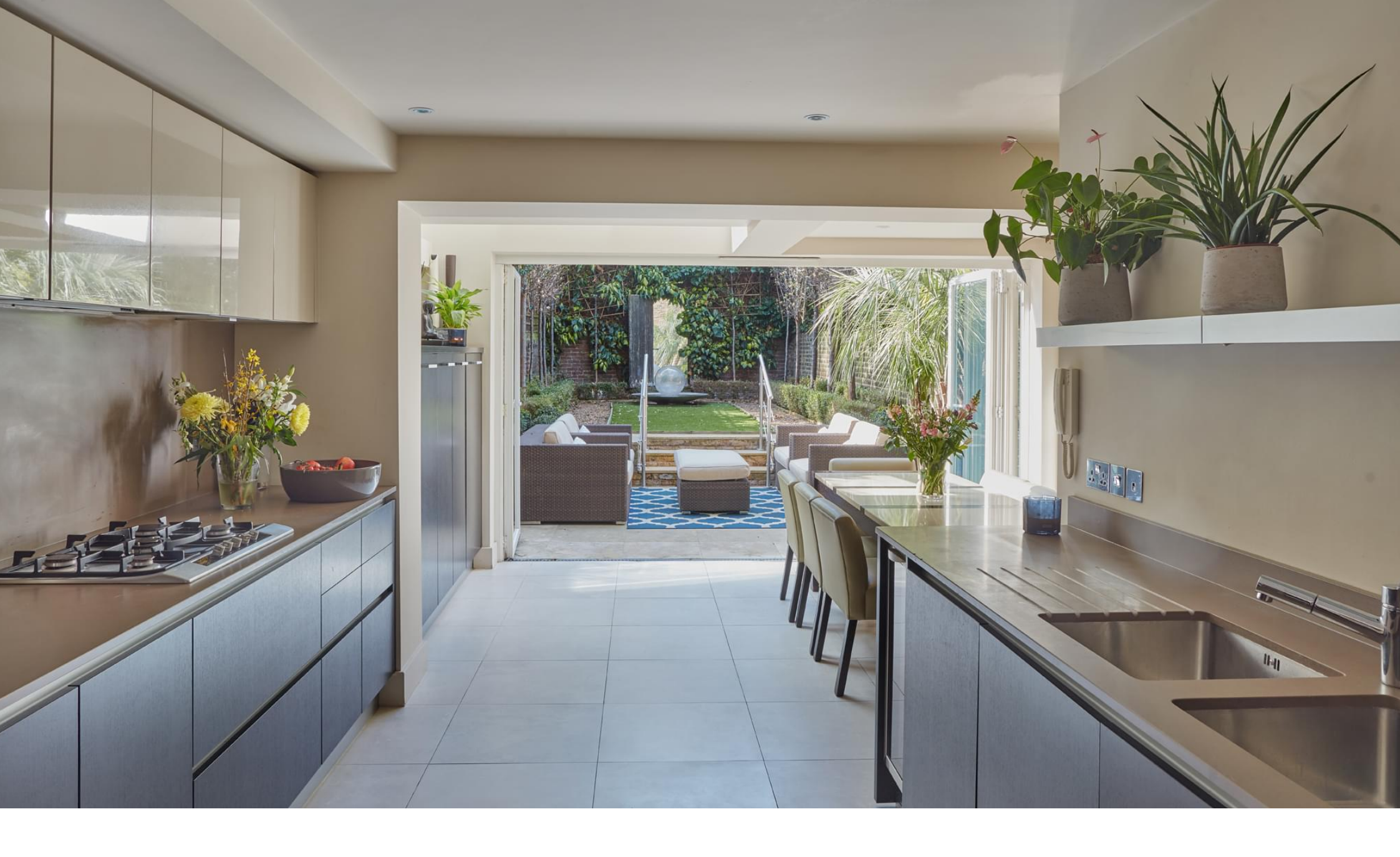
Shaftesbury Villas, Kensington W8