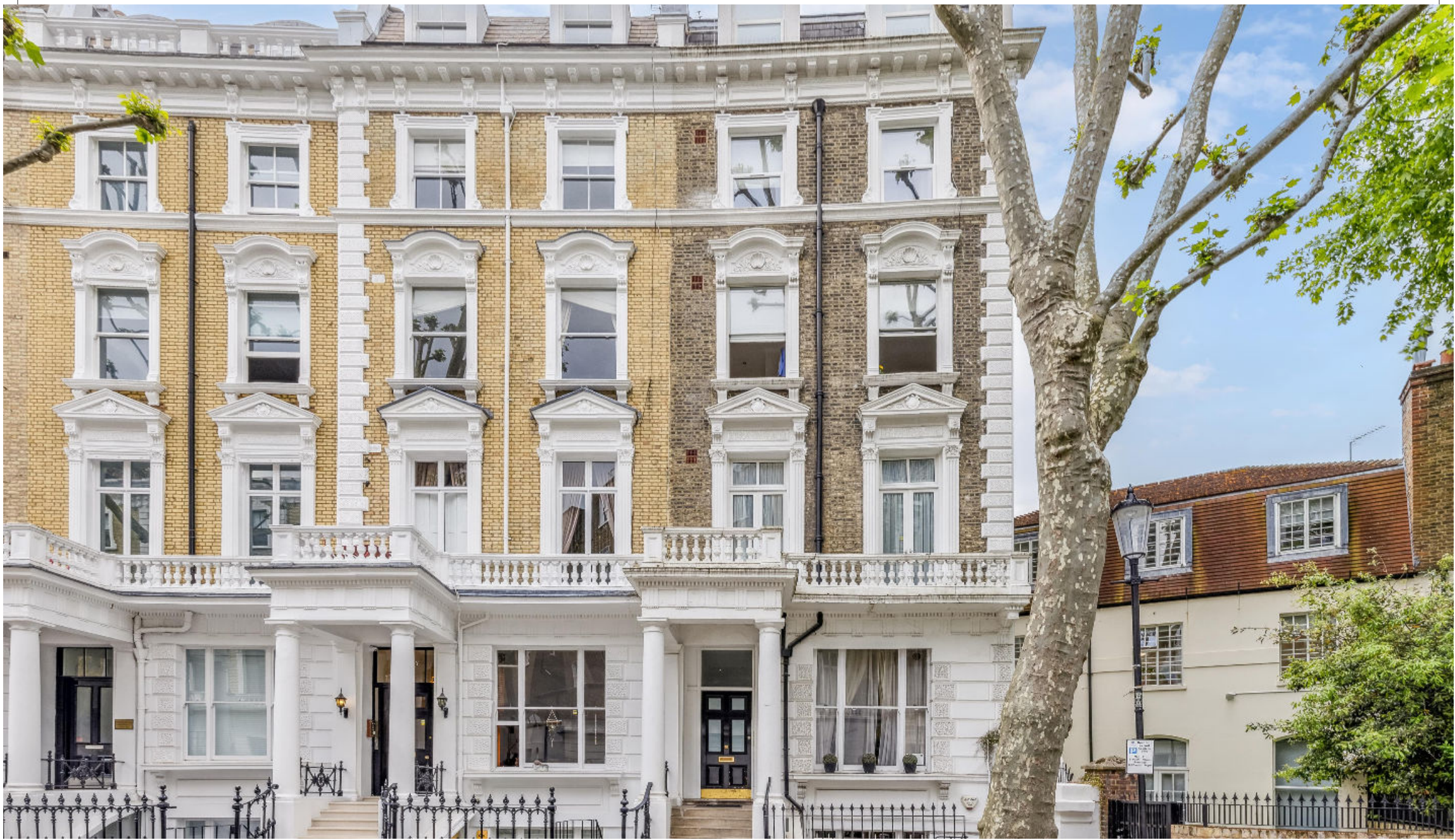
Linden Gardens, Notting Hill W2