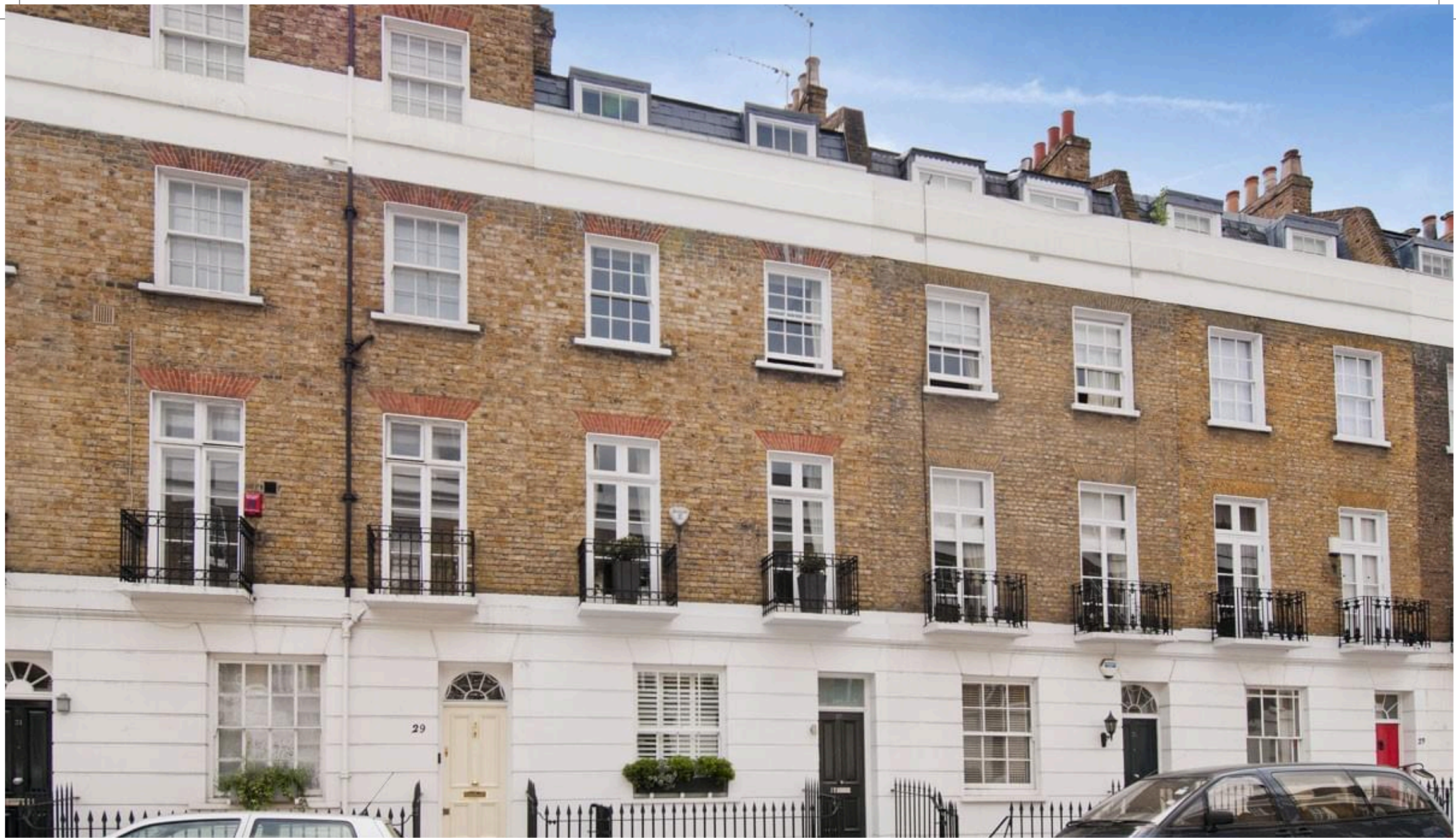
Sydney Street, London SW3