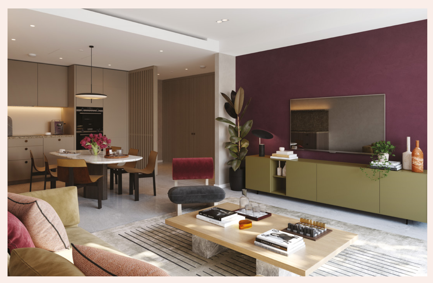
Above: Two bedroom apartment living area. Computer generated images are indicative only.