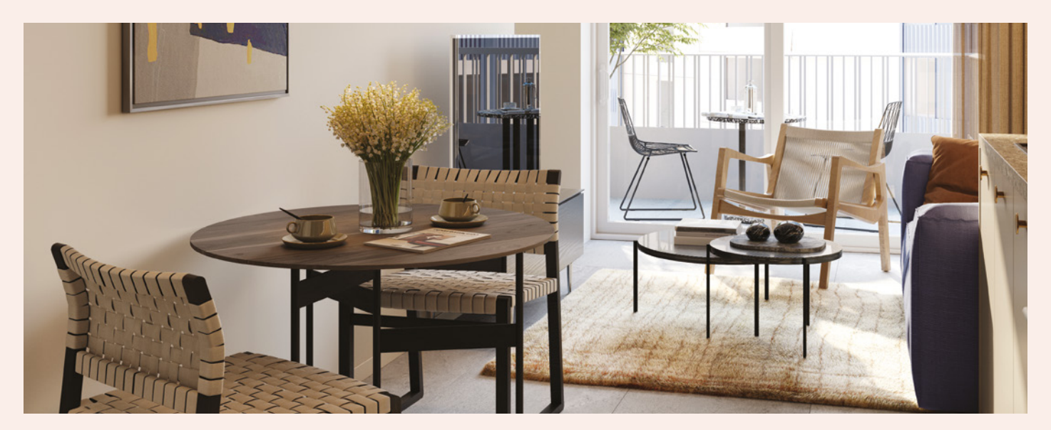
Above: Studio apartment living room. Computer generated images are indicative only.