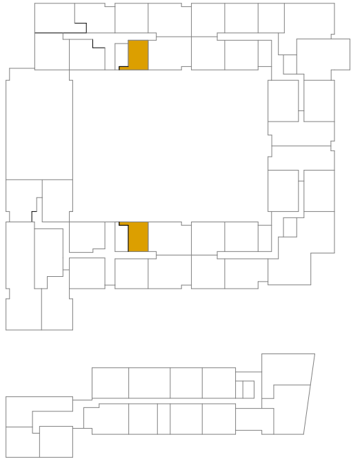
Key Plan Fourth Floor

Indicative Dimensions Living/Dining/ Bedspace Kitchen Hall Acc. Shower Services/ Storage 5.6 m X 6.2 m 2.9 m X 2.4 m 1.9 m X 1.4 m 2.0 m X 2.3 m 1.8 m X 1.3 m (18' - 4" X 20' - 3") (9' - 5" X 7' - 10") (6' - 5" X 4' - 6") (6' - 6" X 7' - 8") (6' - 1" X 4' - 2")