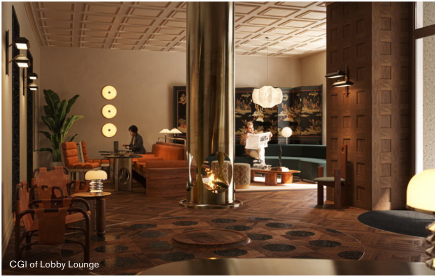
CGI of Lobby Lounge