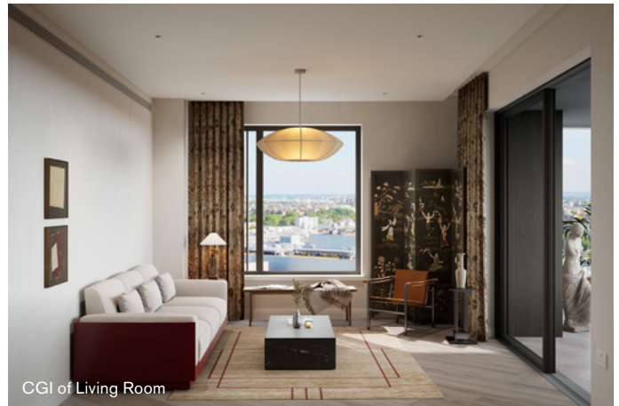
CGI of Living Room