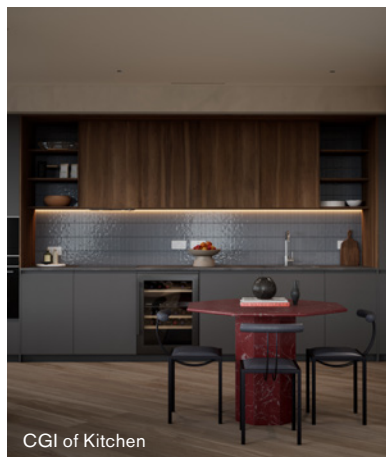
CGI of Kitchen