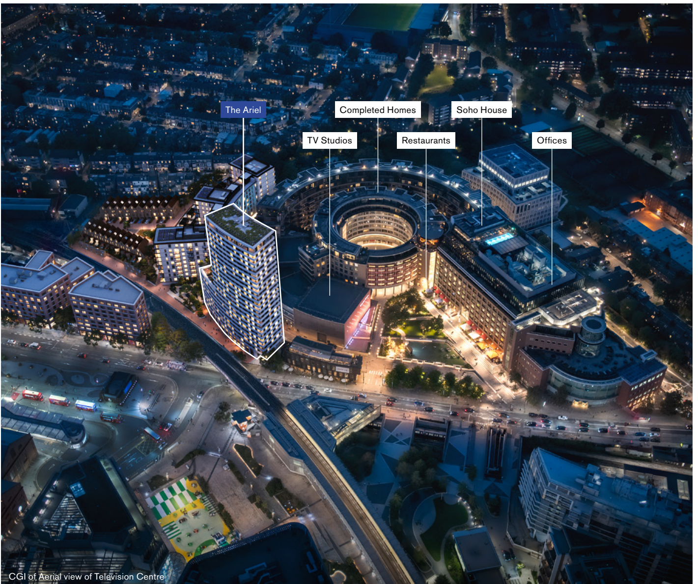
CGI of Aerial view of Television Centre