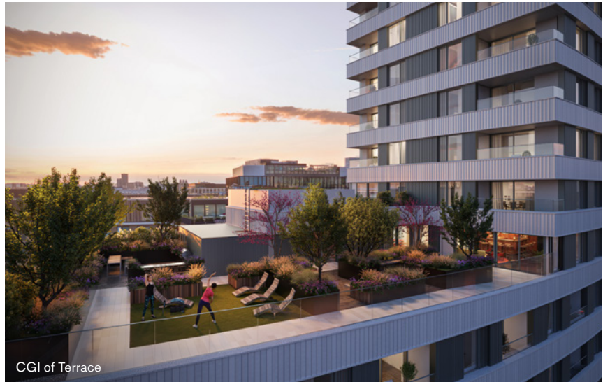
CGI of Terrace