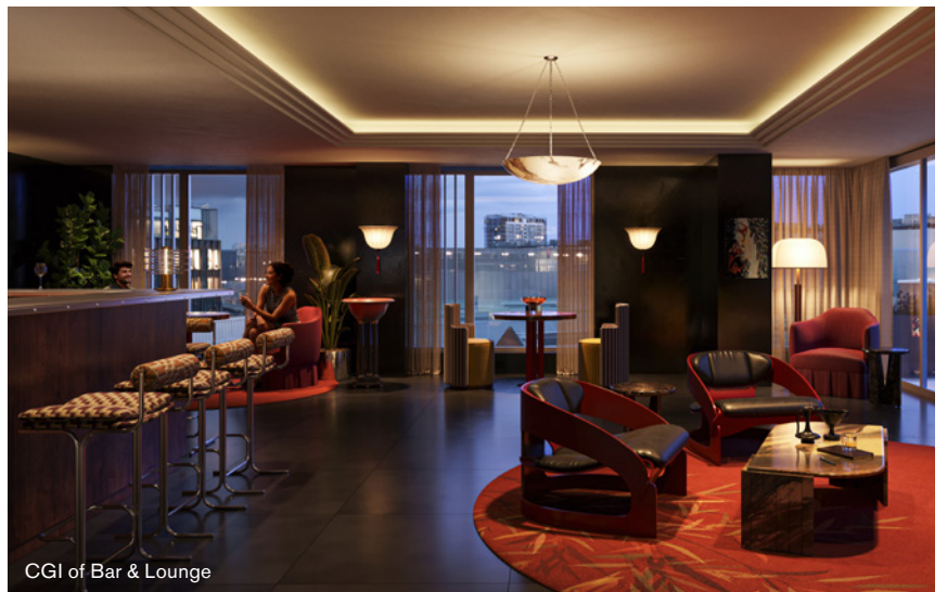
CGI of Bar & Lounge