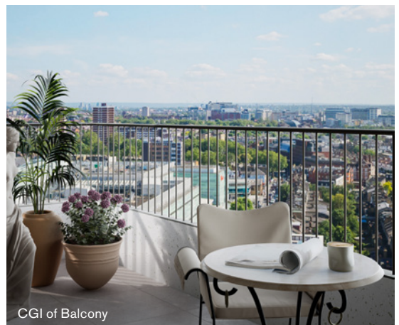
CGI of Balcony