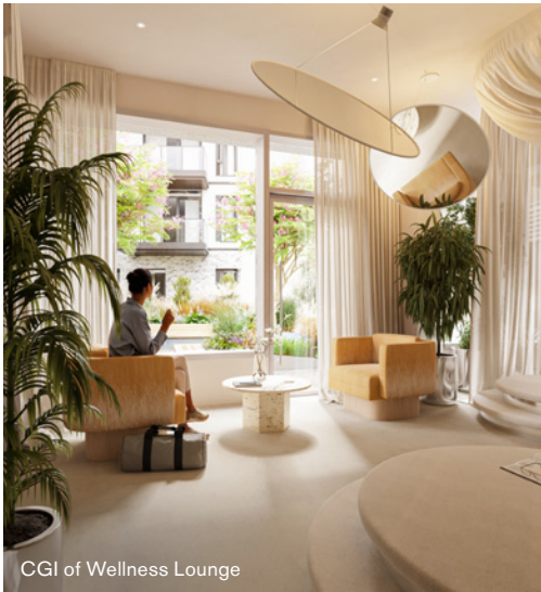
CGI of Wellness Lounge