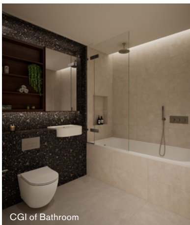
CGI of Bathroom