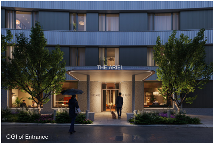
CGI of Entrance