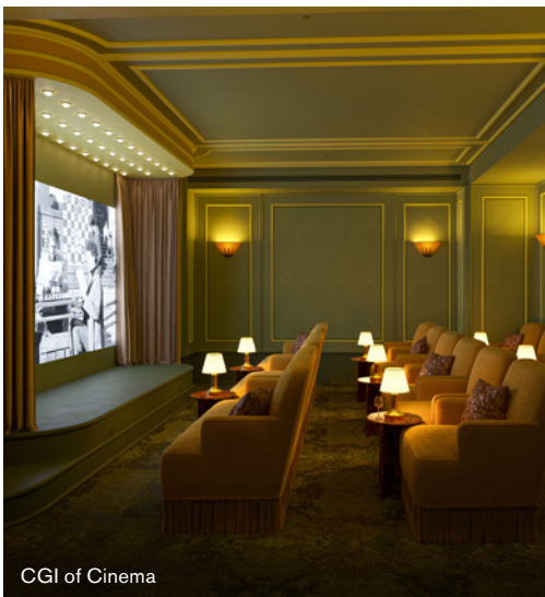
CGI of Cinema