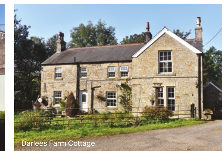
Darlees Farm Cottage