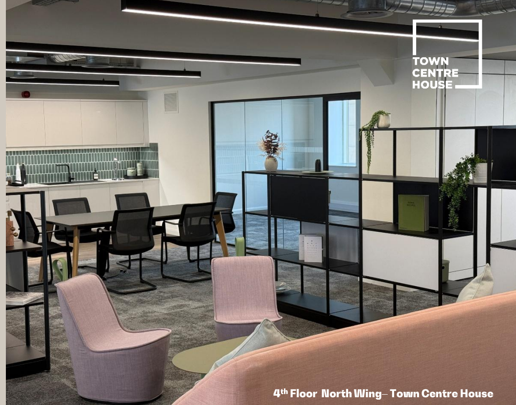
4 th Floor North Wing – Town Centre House