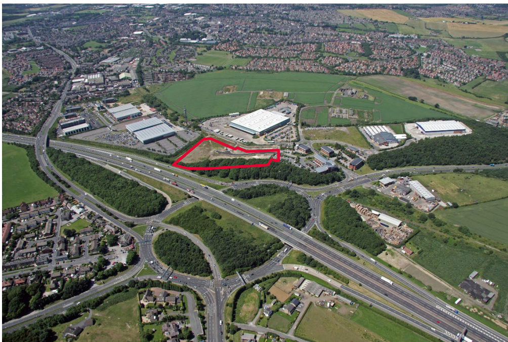
Boundaries are indicative and for identification purposes only

The surrounding area provides a mix of industrial and logistics, offices, hotel and car supermarket. Notable occupiers include Big Motoring World, DHL Tradeteam, James Latham, Dupuy, Evri and The Village Hotel.