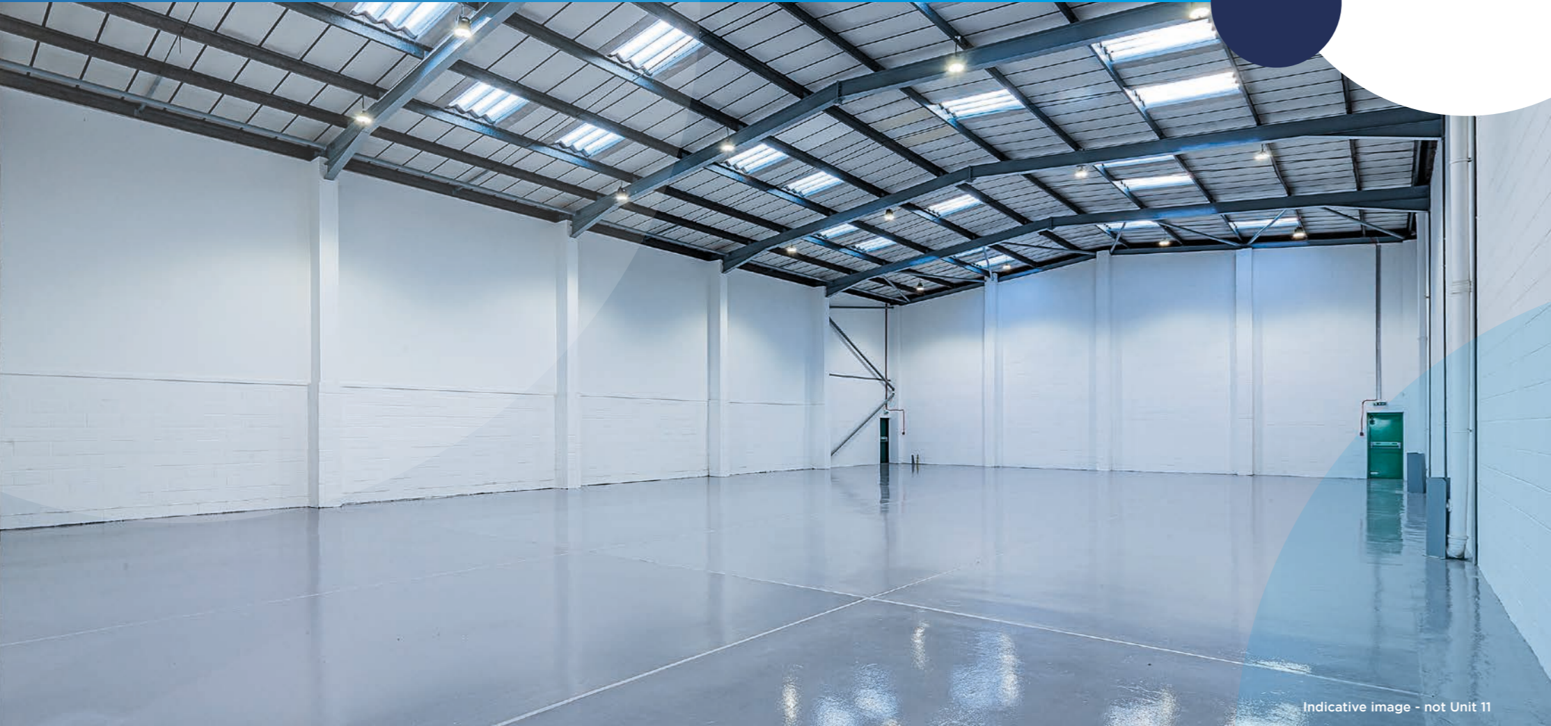
Indicative image - not Unit 11

Under Refurbishment - Available Q3 2025. The unit would suit a range of uses including logistics, manufacturing or trade counter.