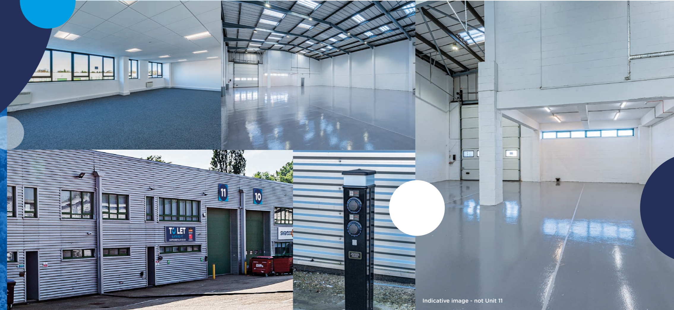
Indicative image - not Unit 11