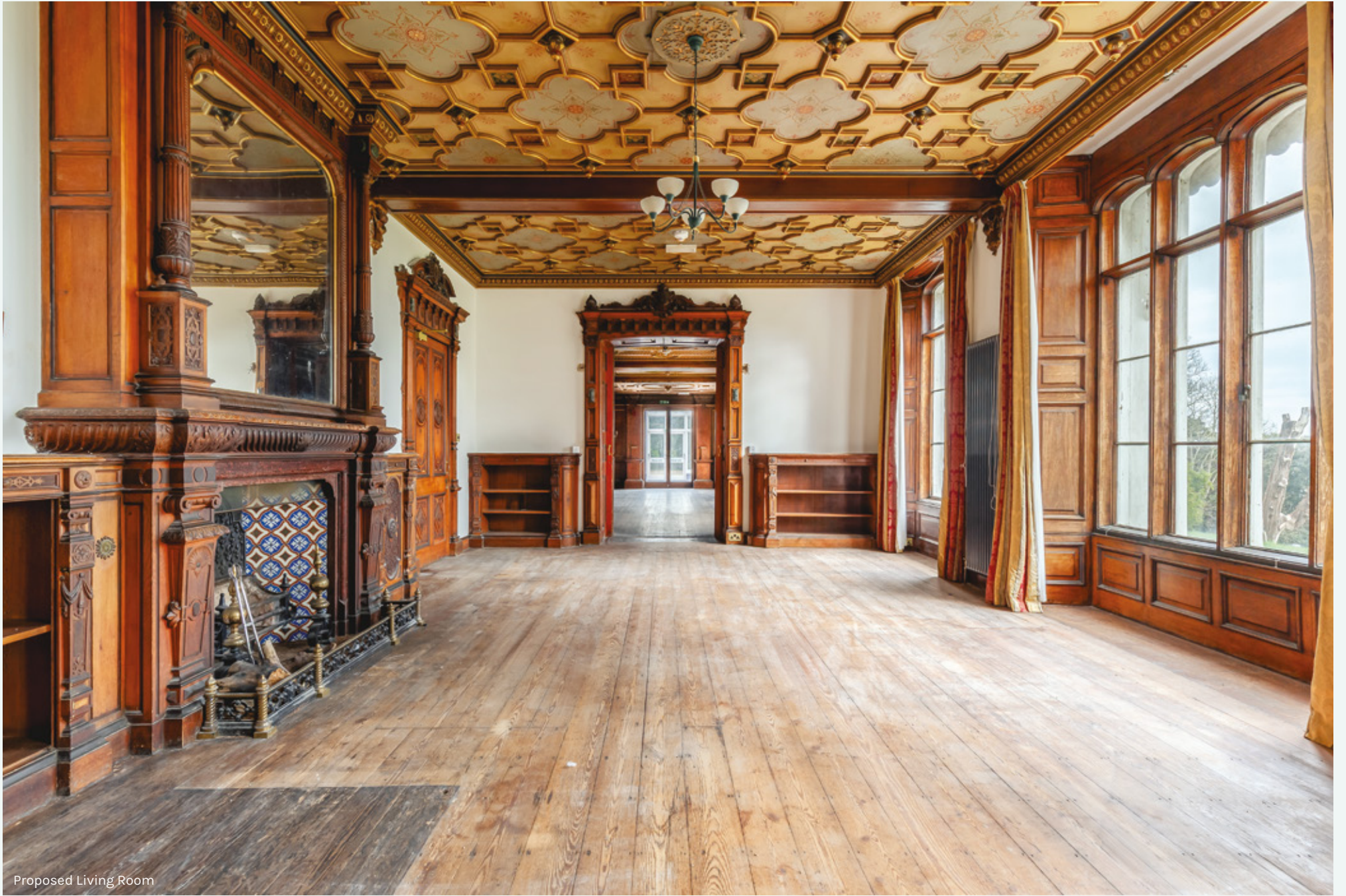
Proposed Living Room