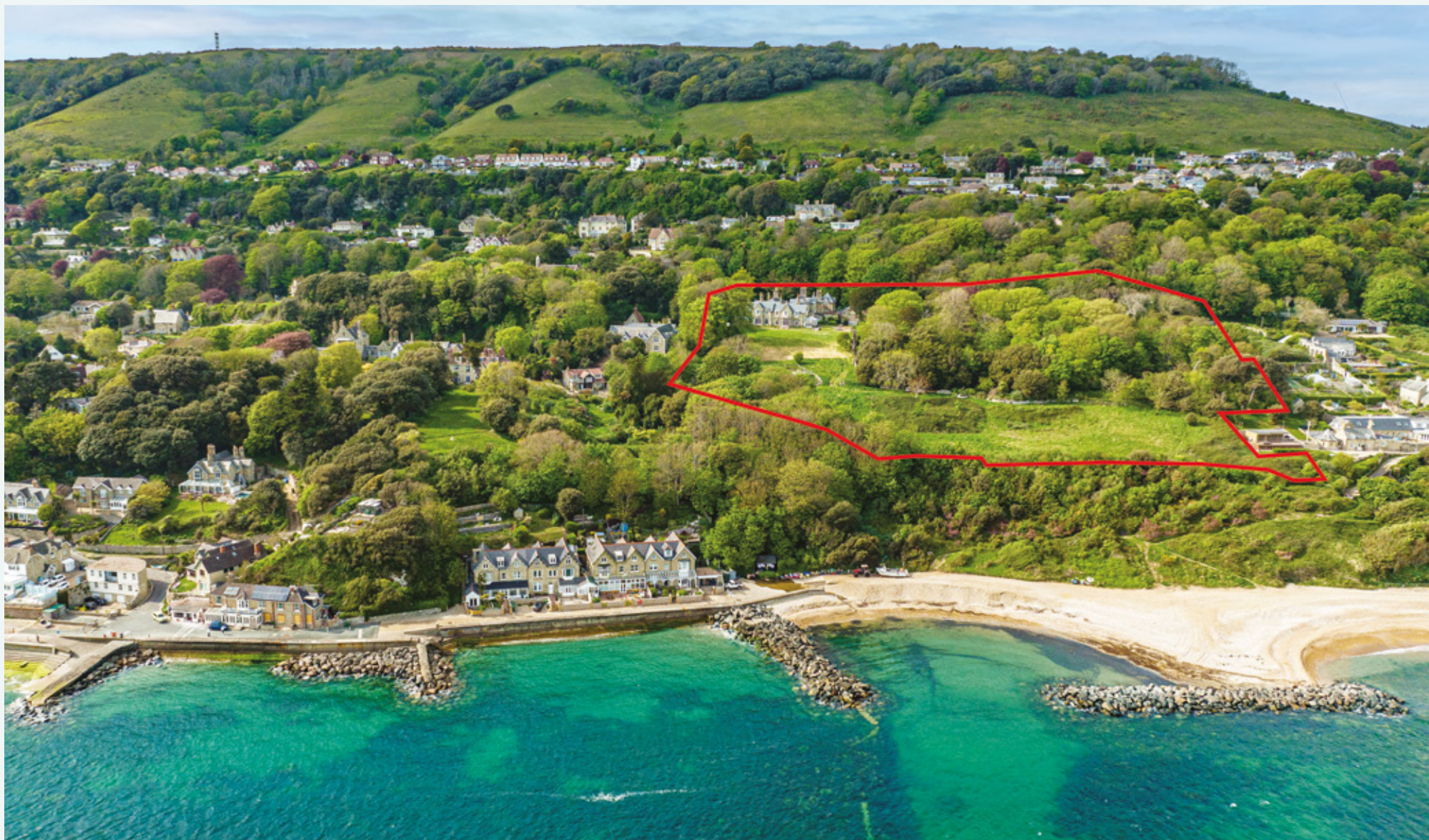
East Dene, Bonchurch, Isle of Wight