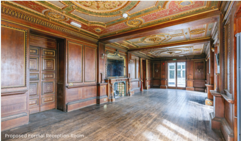
Proposed Formal Reception Room