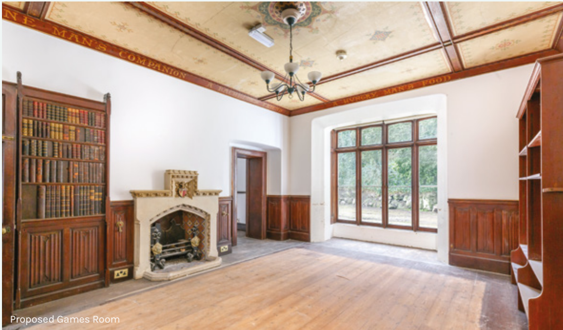
Proposed Games Room

East Dene is being sold on the basis of achieving consent for residential use, (having been an activity centre and wedding venue in recent years). As illustrated on the floorplans, this will provide an impressive main residence of around 8,847 sq ft with five reception rooms and six bedroom suites. To the rear of the house is extensive versatile ancillary accommodation of around 7,211 sq ft, currently proposed to provide a mixture of guest and staff accommodation, offices, a workshop etc. but also has potential for provision of holiday lets subject to the necessary consent. The house requires renovation including installation of bathrooms and kitchens and reconfiguration as per the plans.