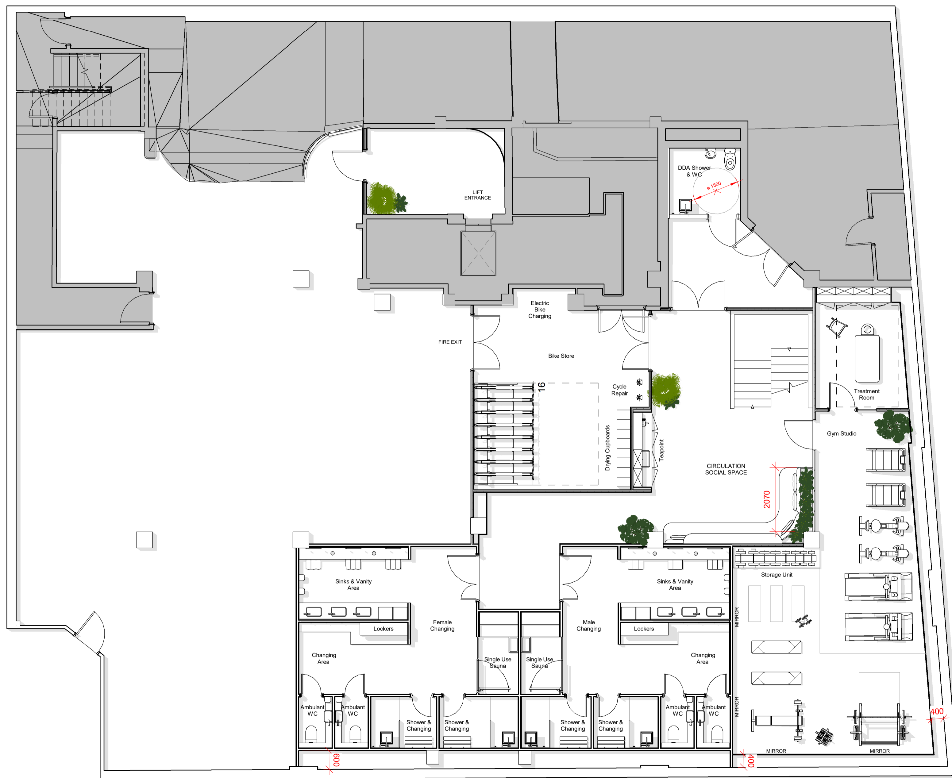
Basement Feasibility Plan 1 : 75