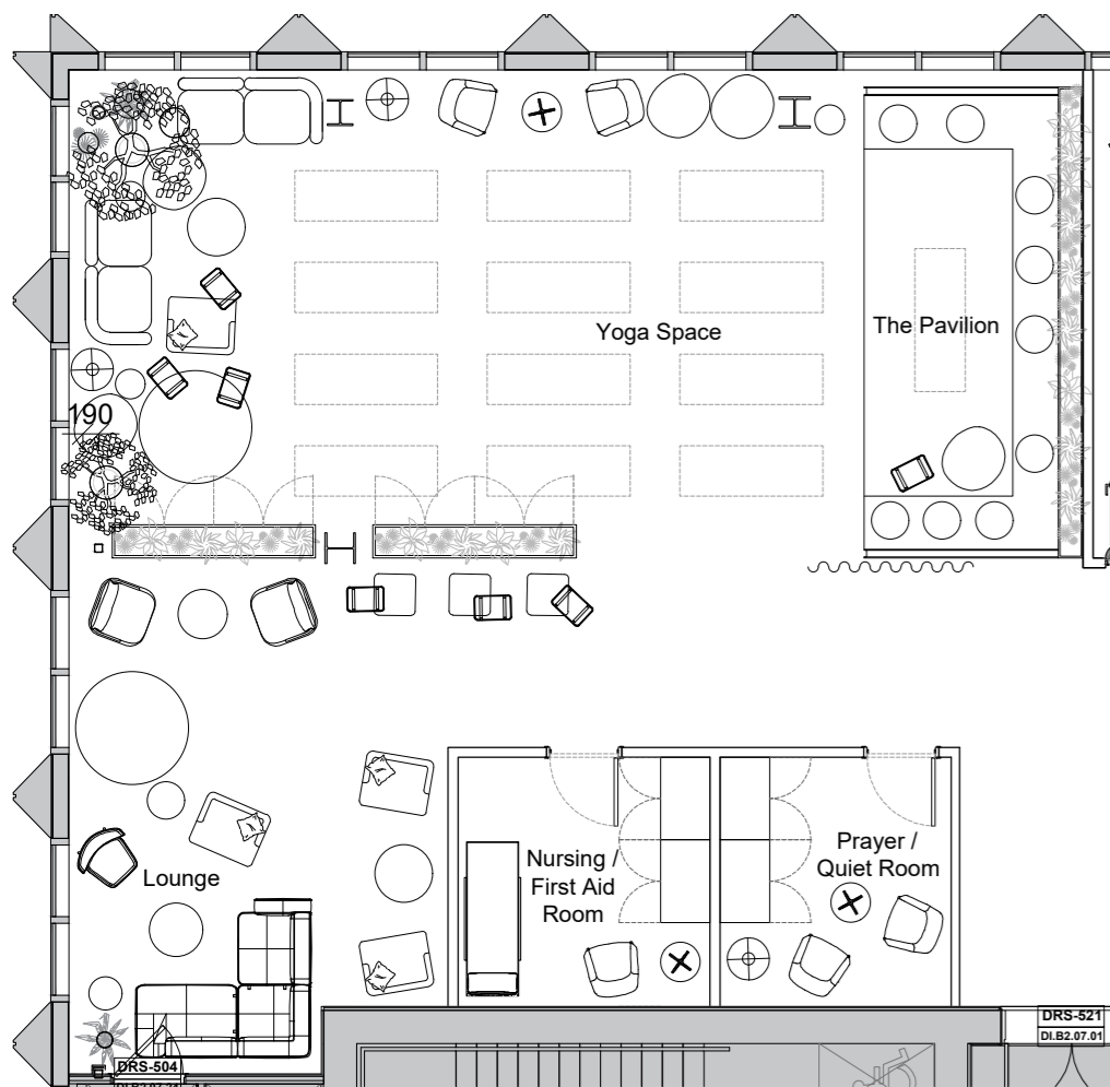
Wellness Area - Yoga Configuration 1:100 @ A2