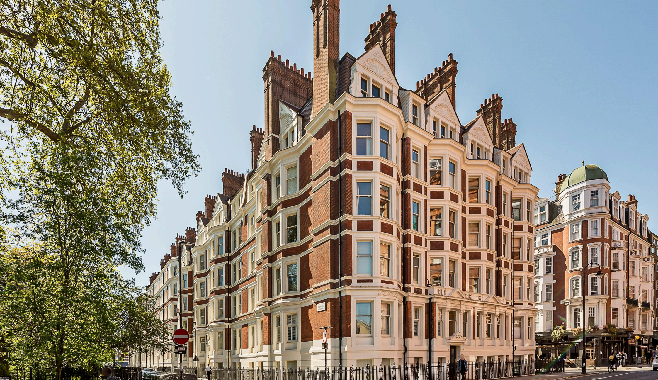
Ridgmount Gardens, Fitzrovia, London W1