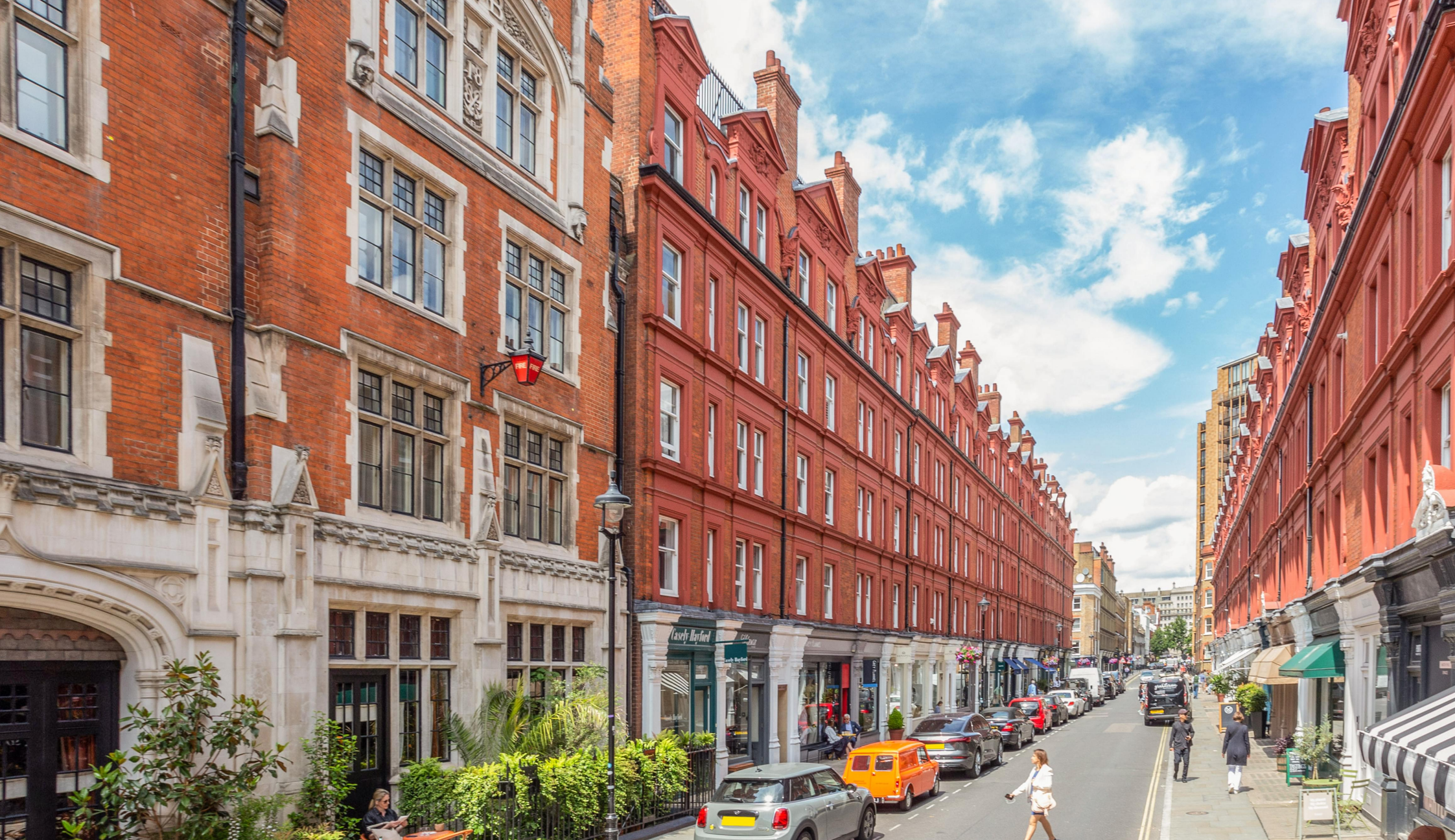
Chiltern Street, Marylebone WIU