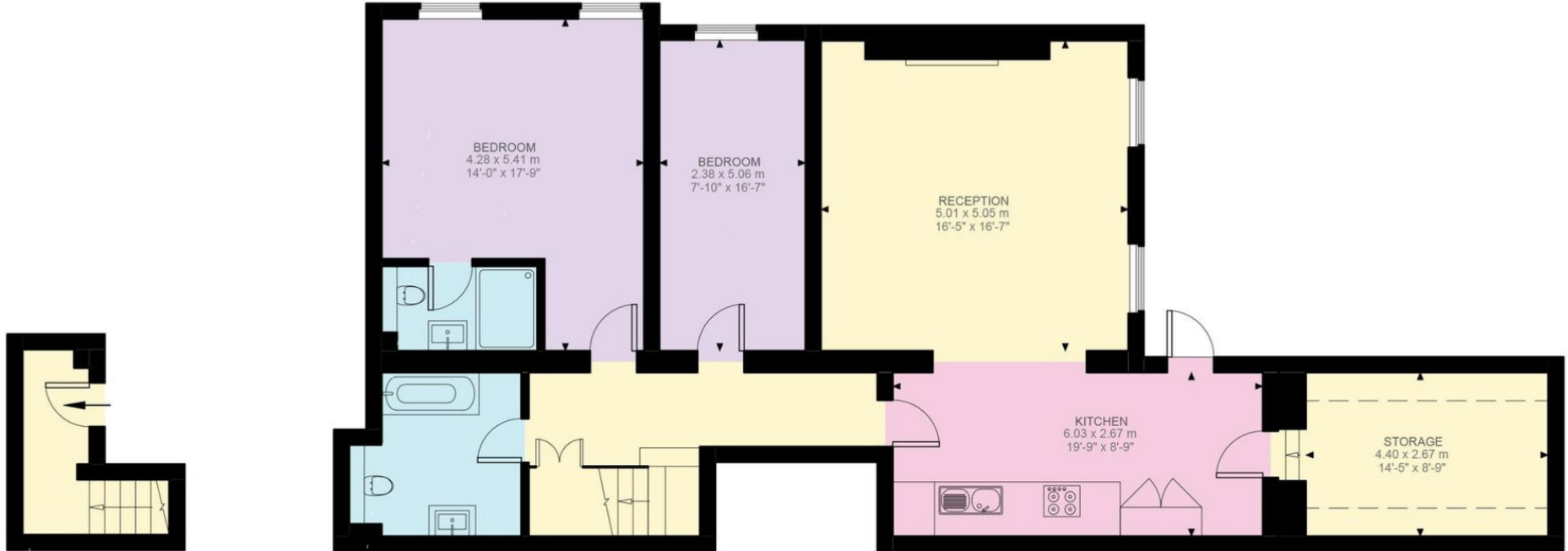
Entrance To Lower Ground Floor 48 ft 2