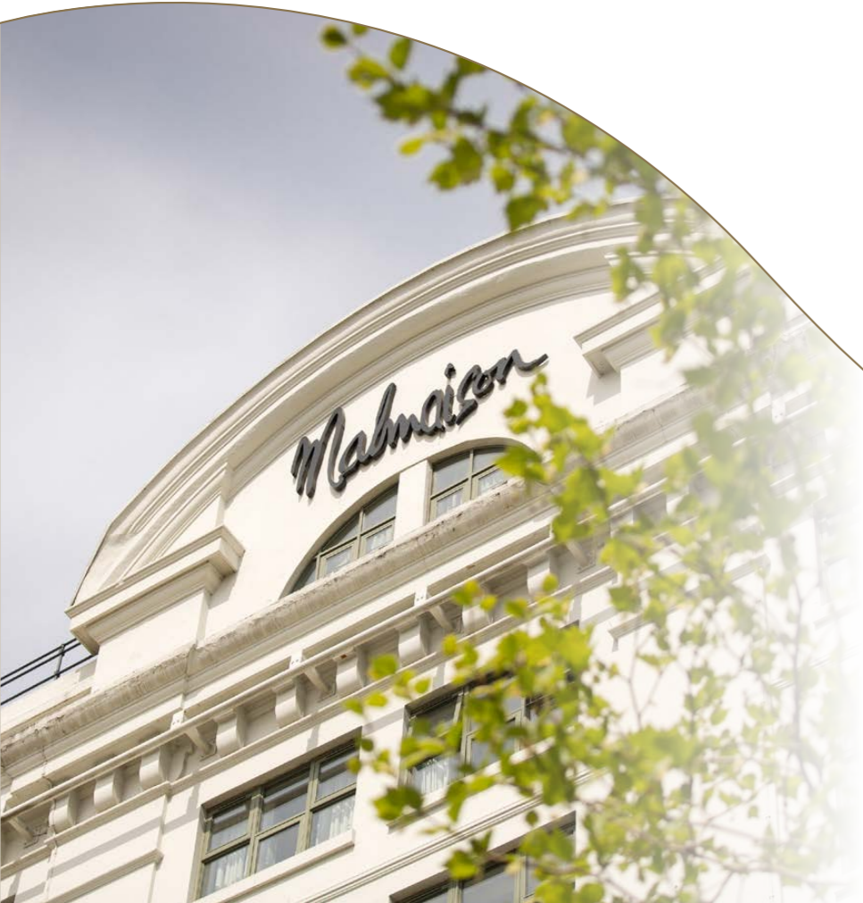
MALMAISON The Malmaison Hotel is one of the most iconic hotels in Newcastle with 22 plush rooms and suites.

Demand continues to outweigh supply and Number One Quayside presents a rare opportunity to acquire a prime site for residential development in a lively and social part of the city.