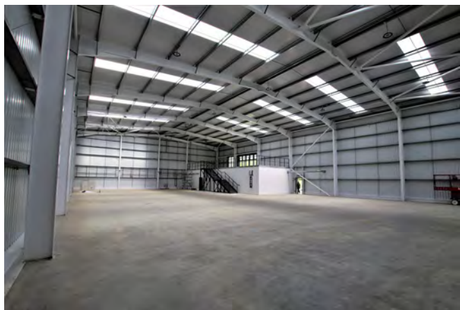
Sadler Forster Way Scheme