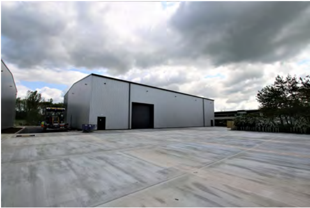
Sadler Forster Way Scheme