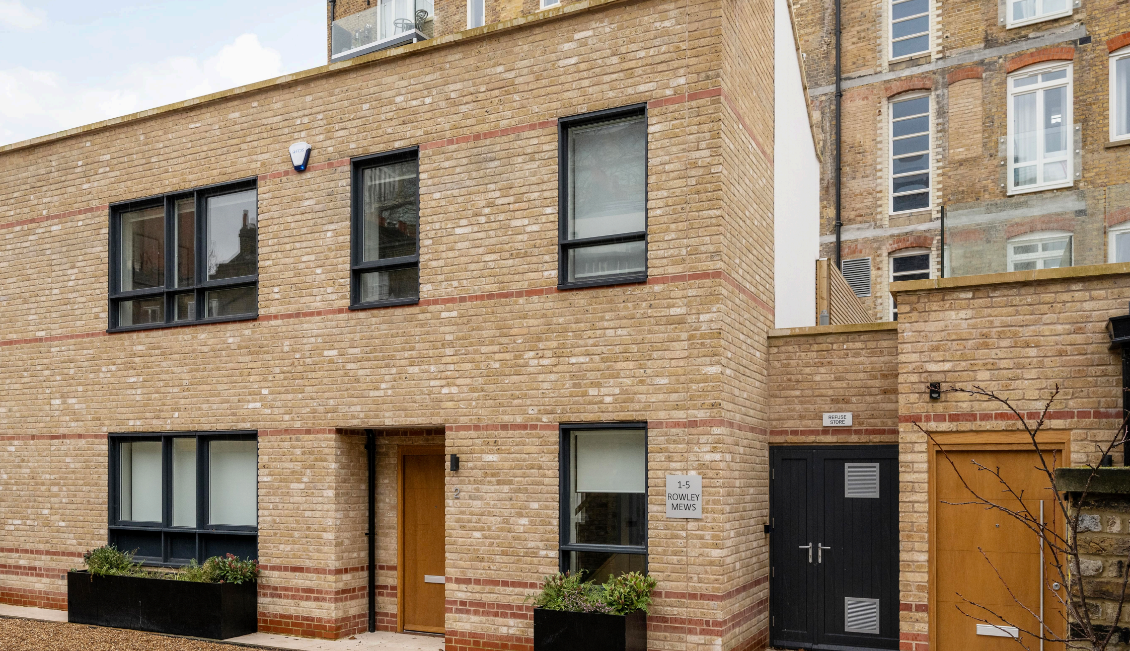
Rowley Mews, Kensington W14