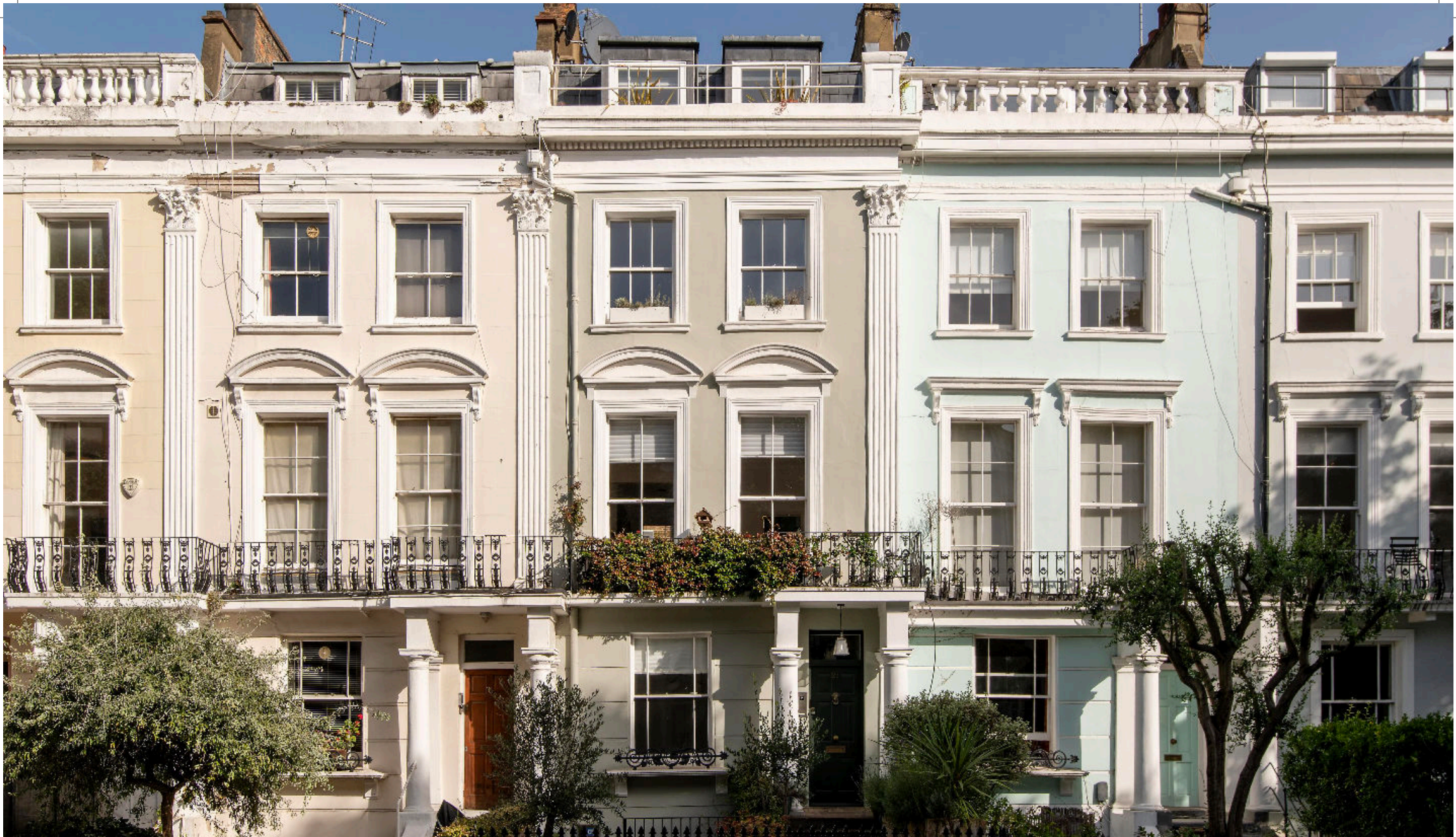
Sutherland Place, Notting Hill W2