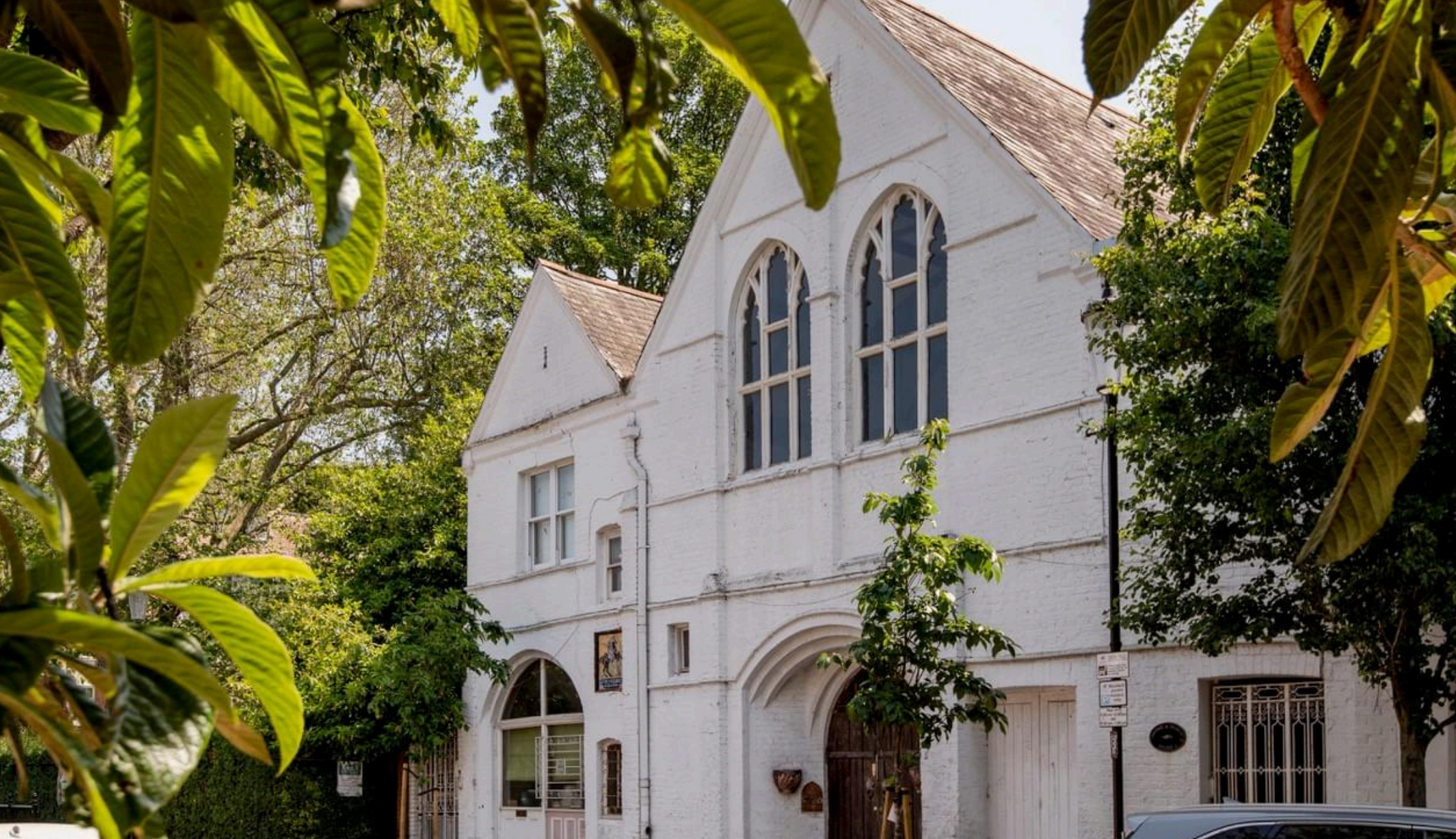
Mary Place, Notting Hill W11