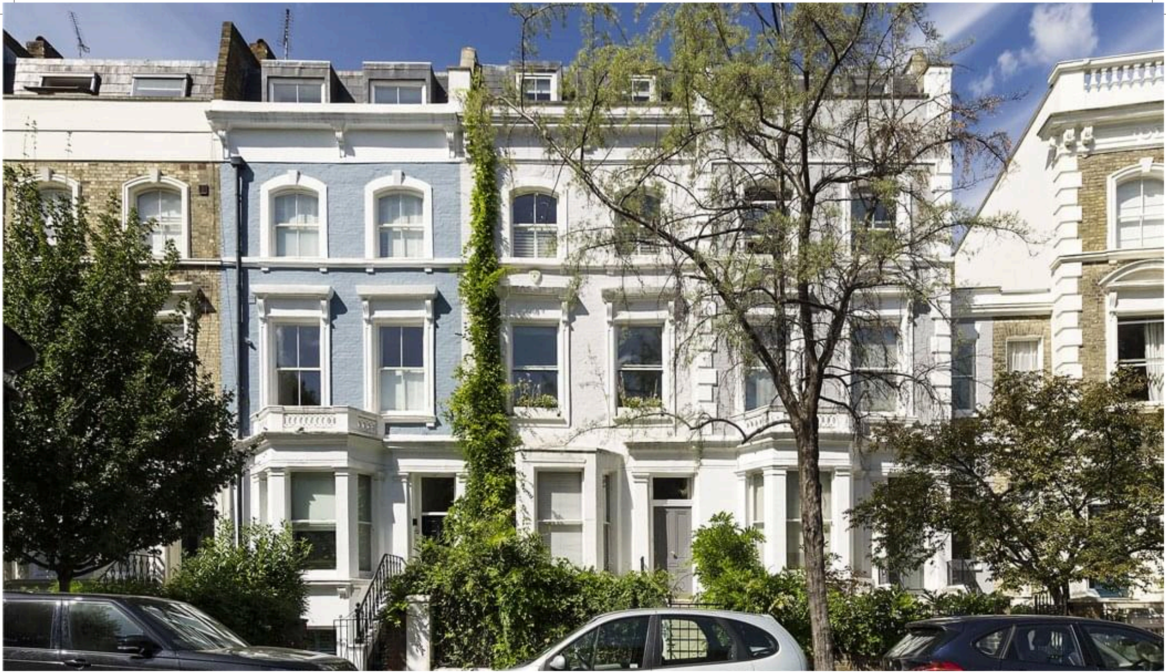
Lancaster Road, Notting Hill W11