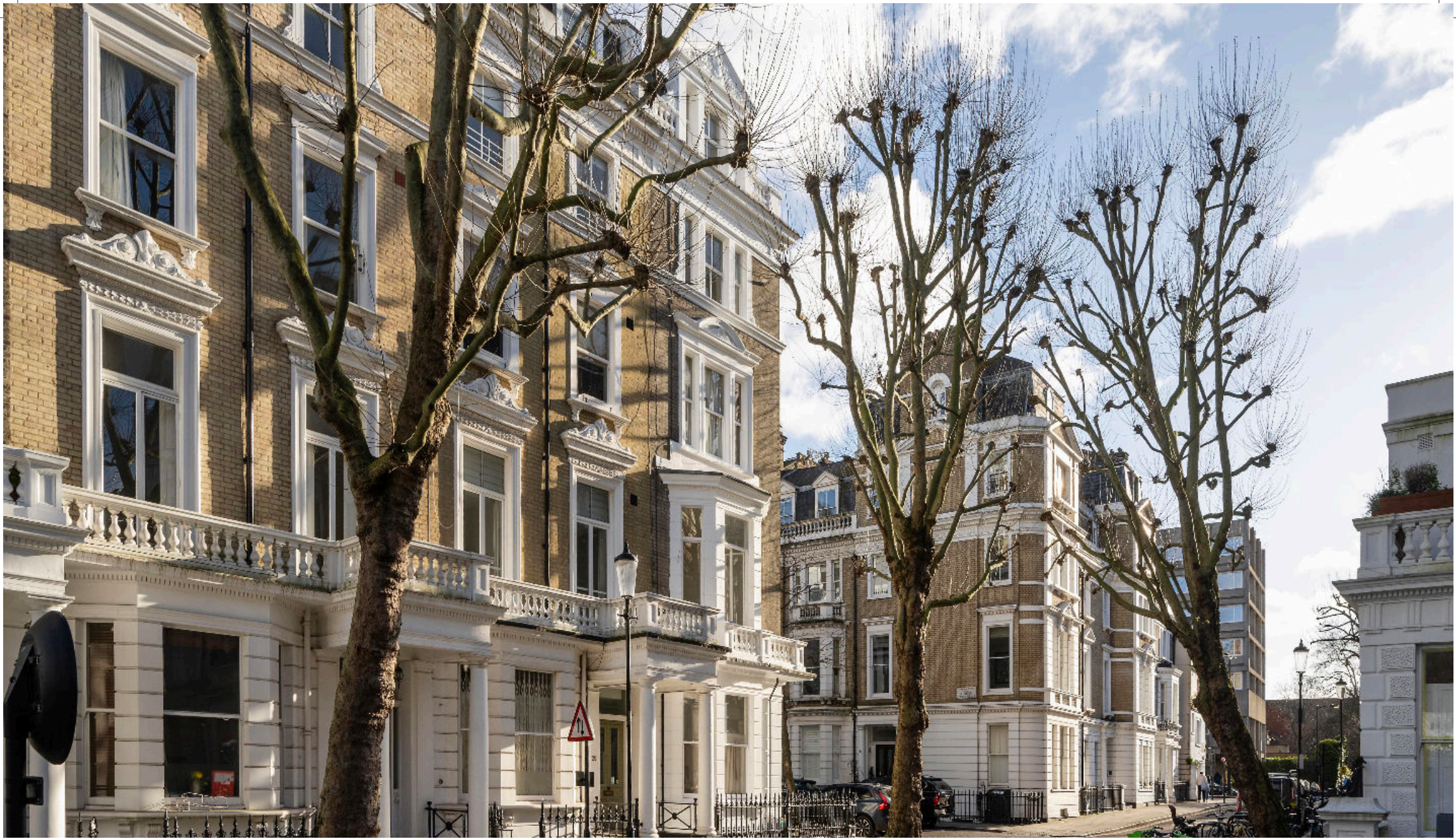
Linden Gardens, Notting Hill W2