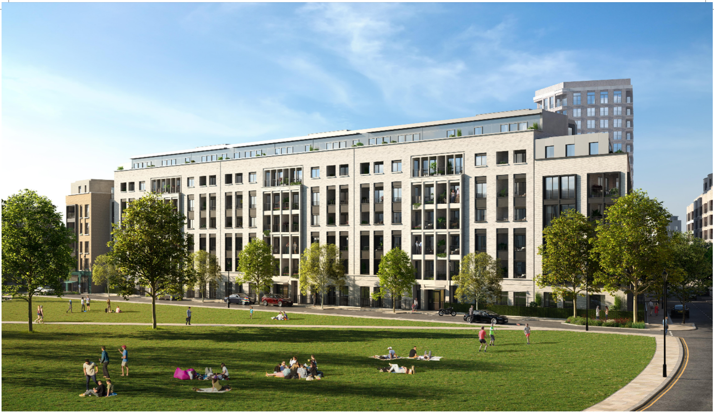
The Auria, Notting Hill W10