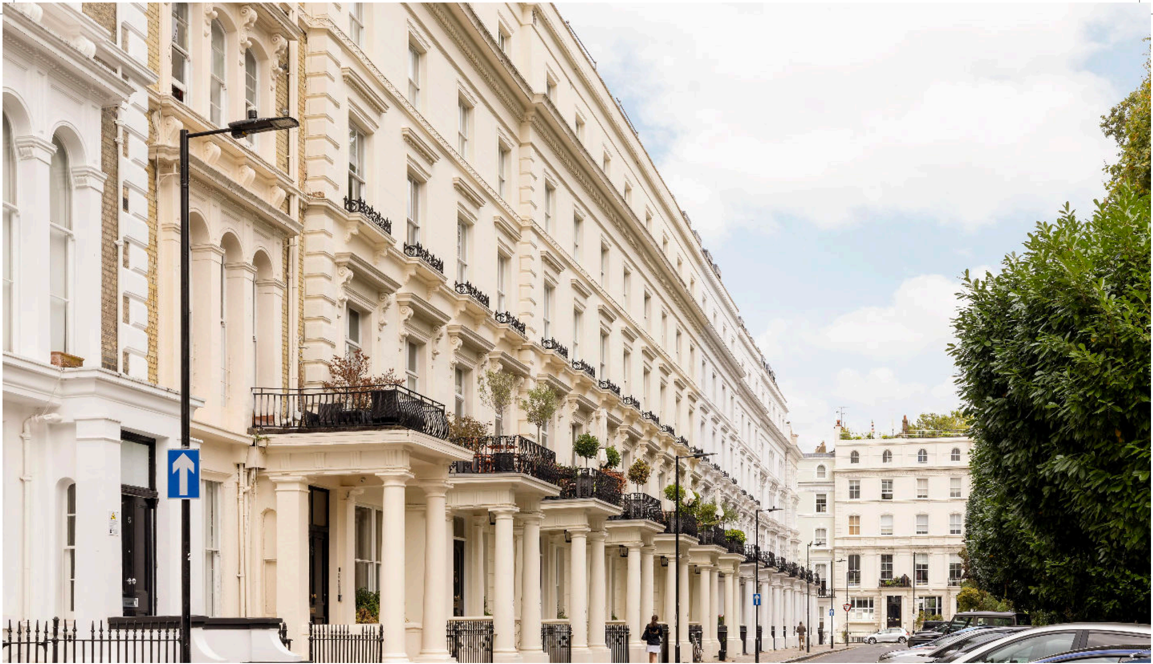
Leinster Square, Notting Hill W2