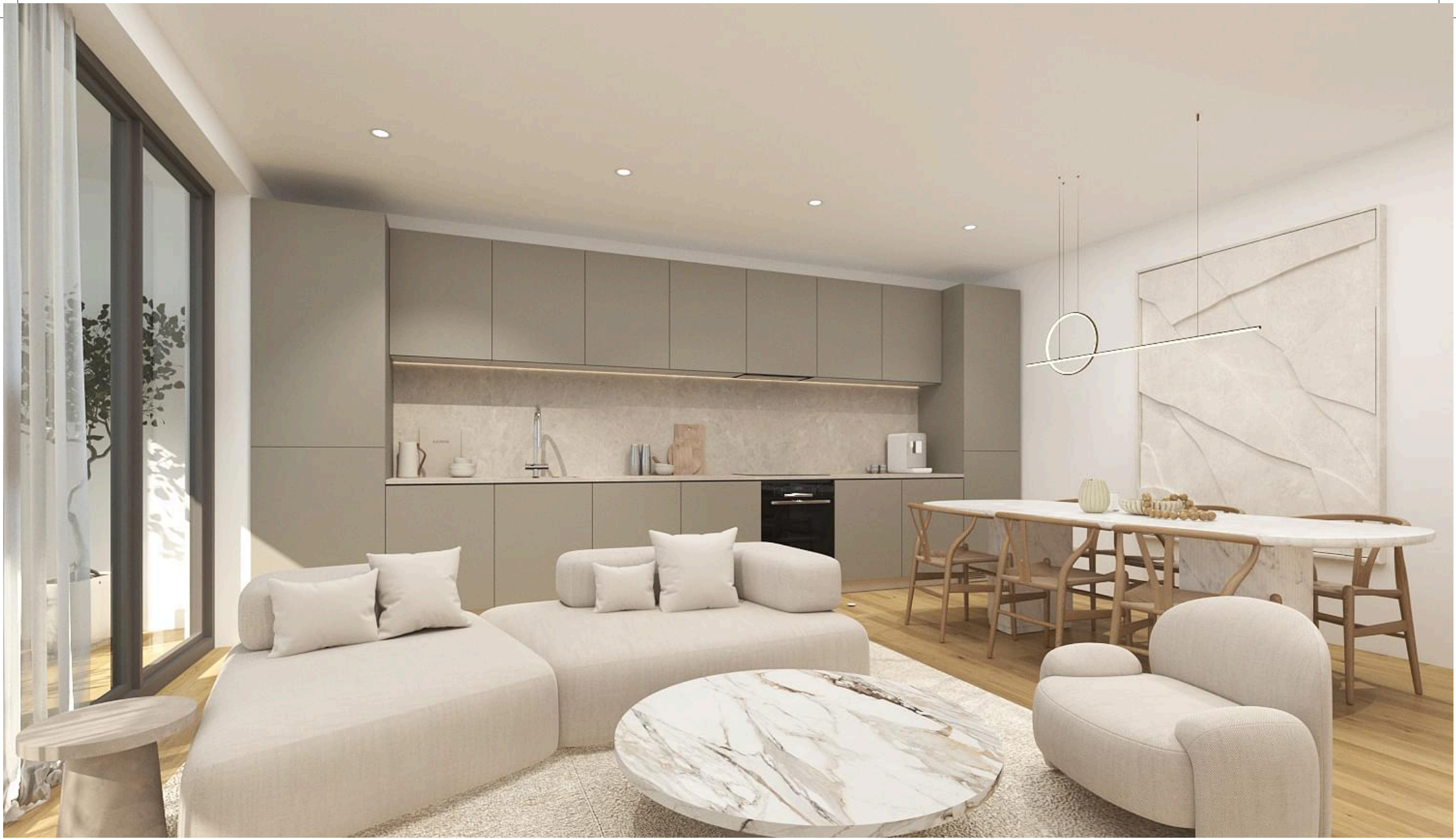
The Auria, Notting Hill W10