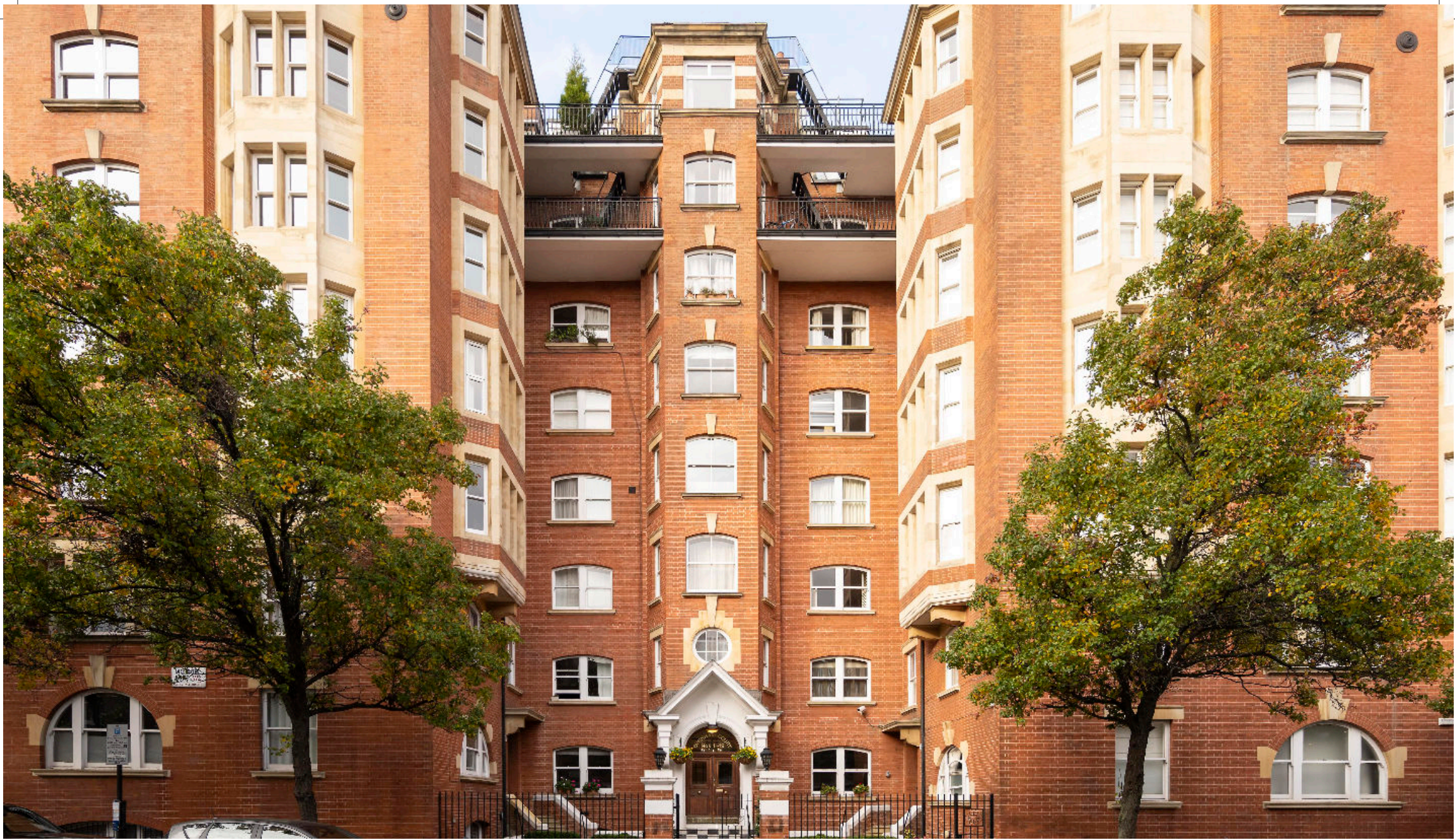
Burnham Court, Notting Hill W2