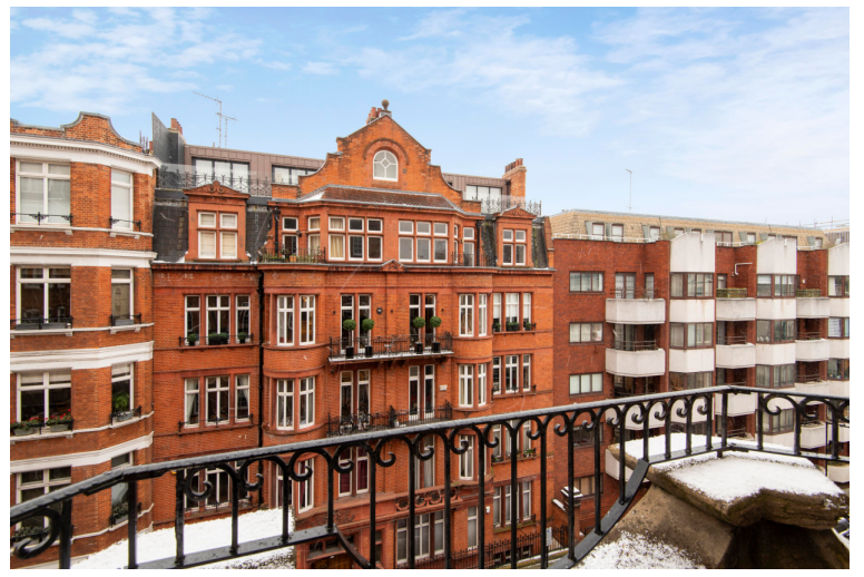
Moscow Road is perfectly positioned for the amenities of Westbourne Grove. Queensway Underground station (Central line) is within walking distance as is Notting Hill Underground station (District, Circle and Central line)

Further accommodation includes a separate kitchen with integrated appliances, a reception room and family bathroom.