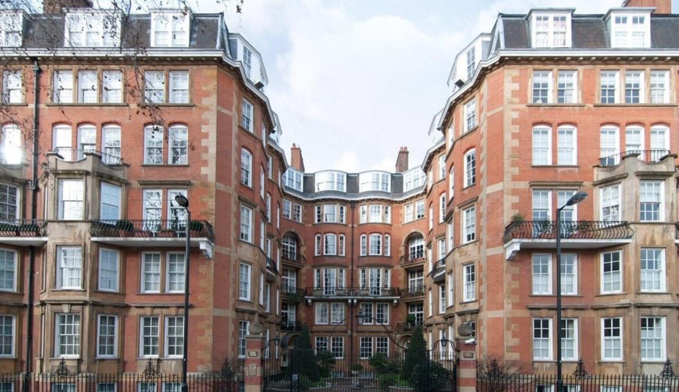
Palace Court, Notting Hill W2