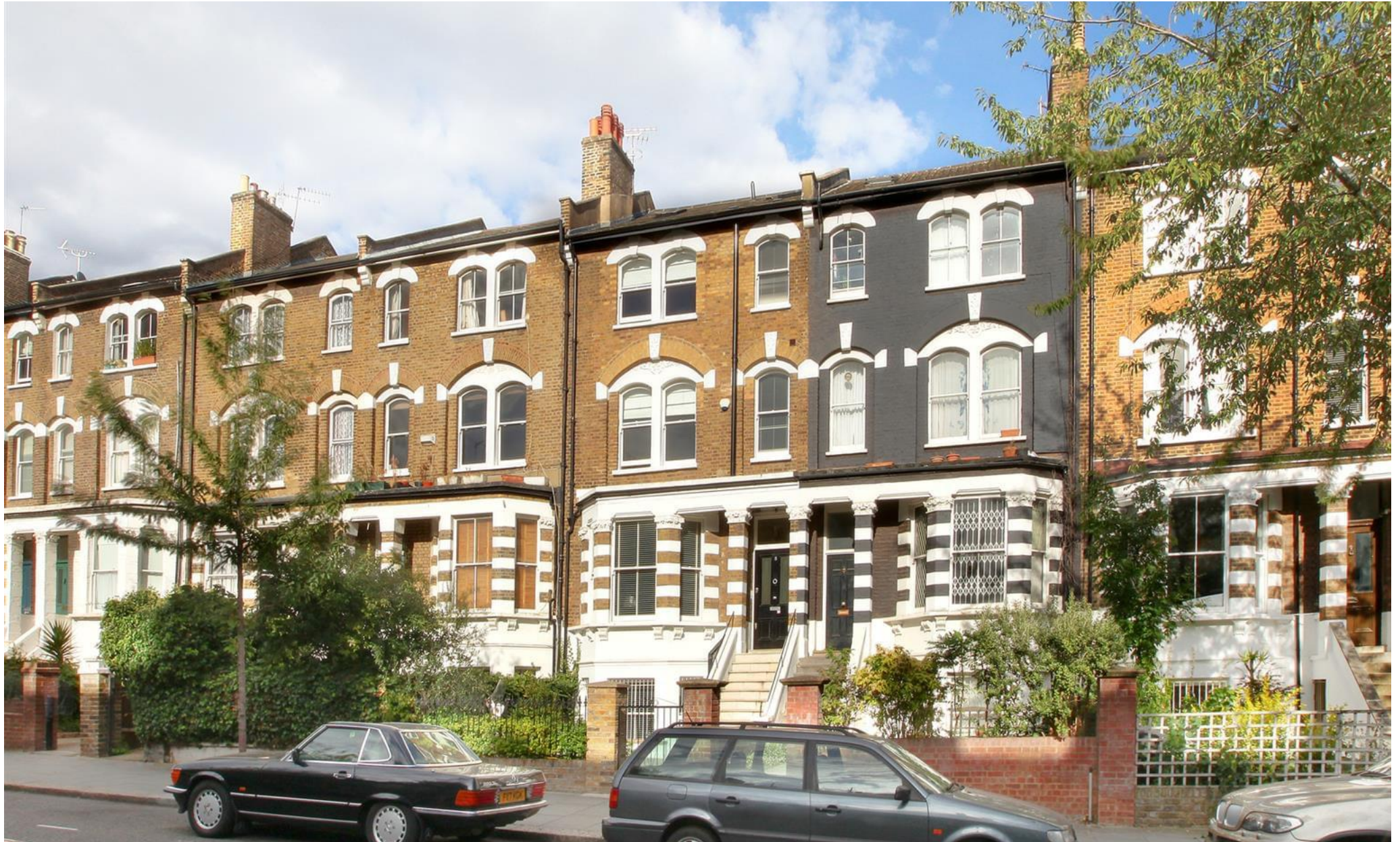
St Lawrence Terrace, Notting Hill W10