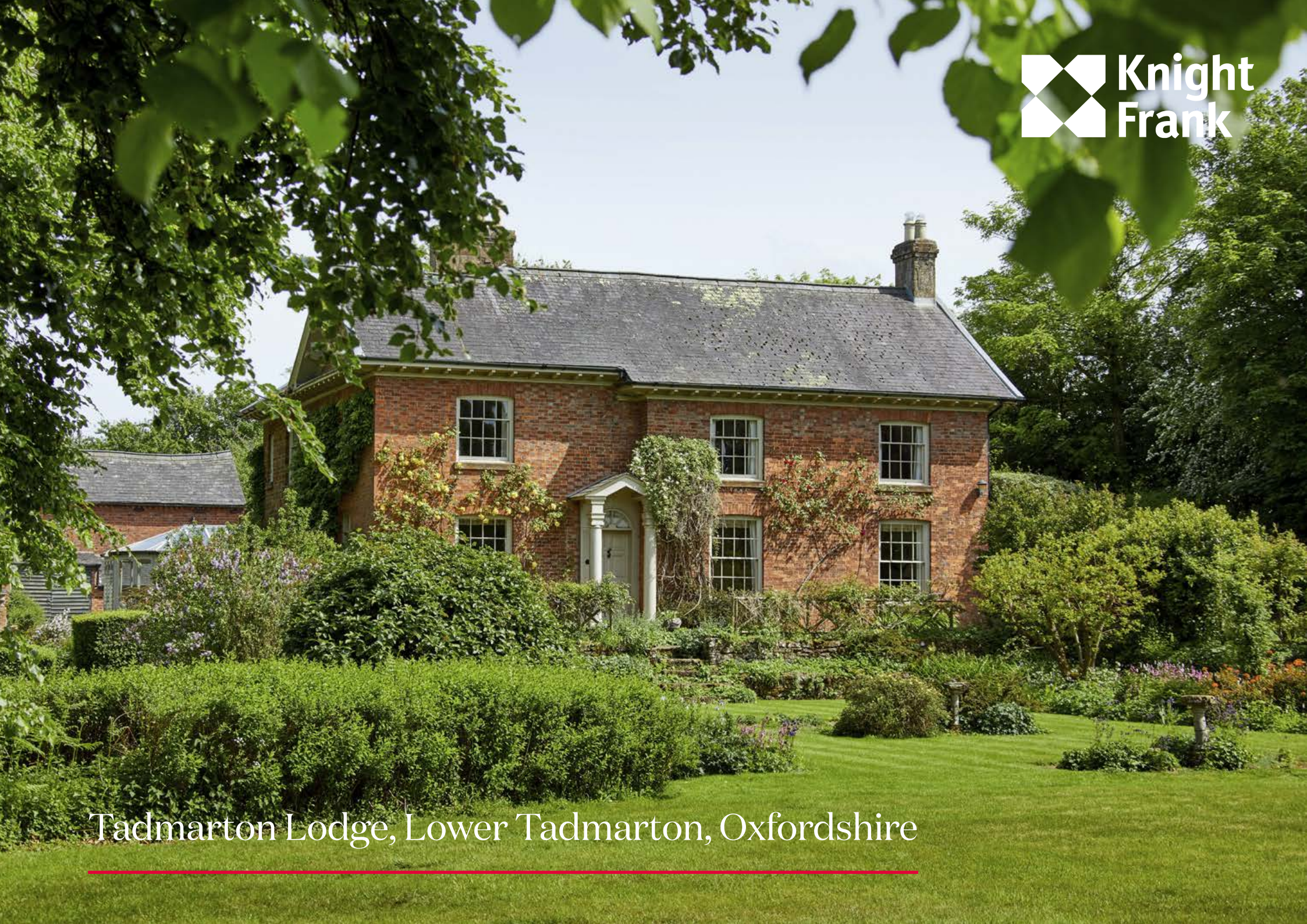
Tadmarton Lodge, Lower Tadmarton, Oxfordshire