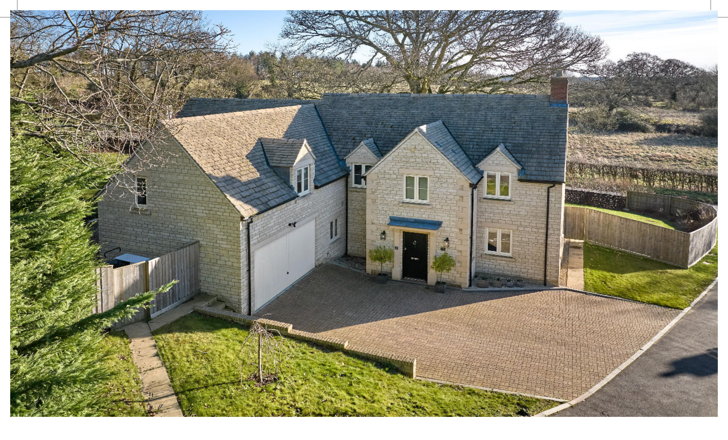
Oakwood, Charlbury, Chipping Norton