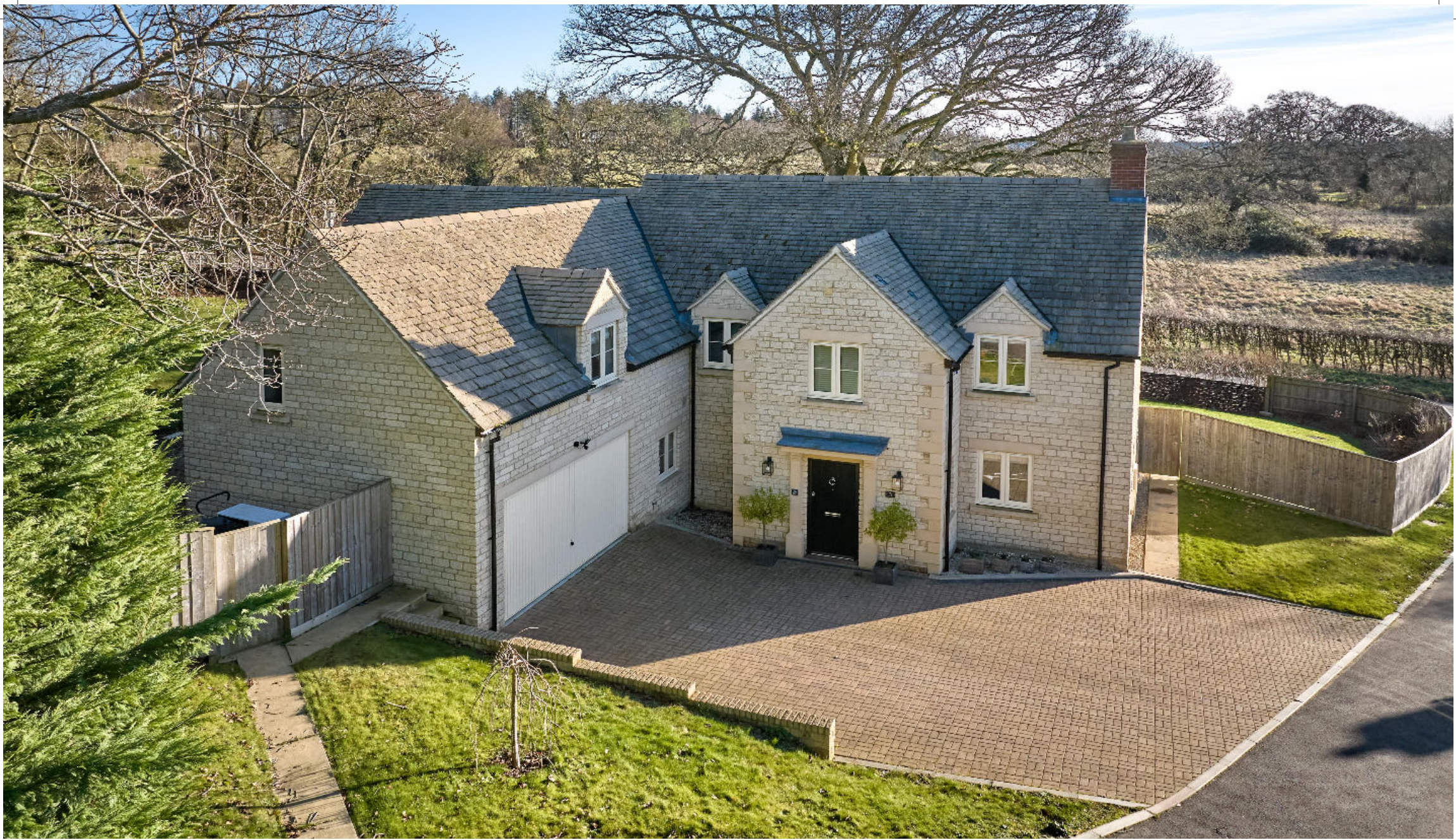
Oakwood, Charlbury, Chipping Norton