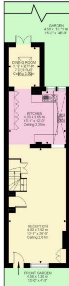
Ground Floor 584 ft 2