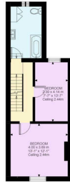
First Floor 437 ft 2