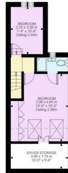
Second Floor 333 ft 2