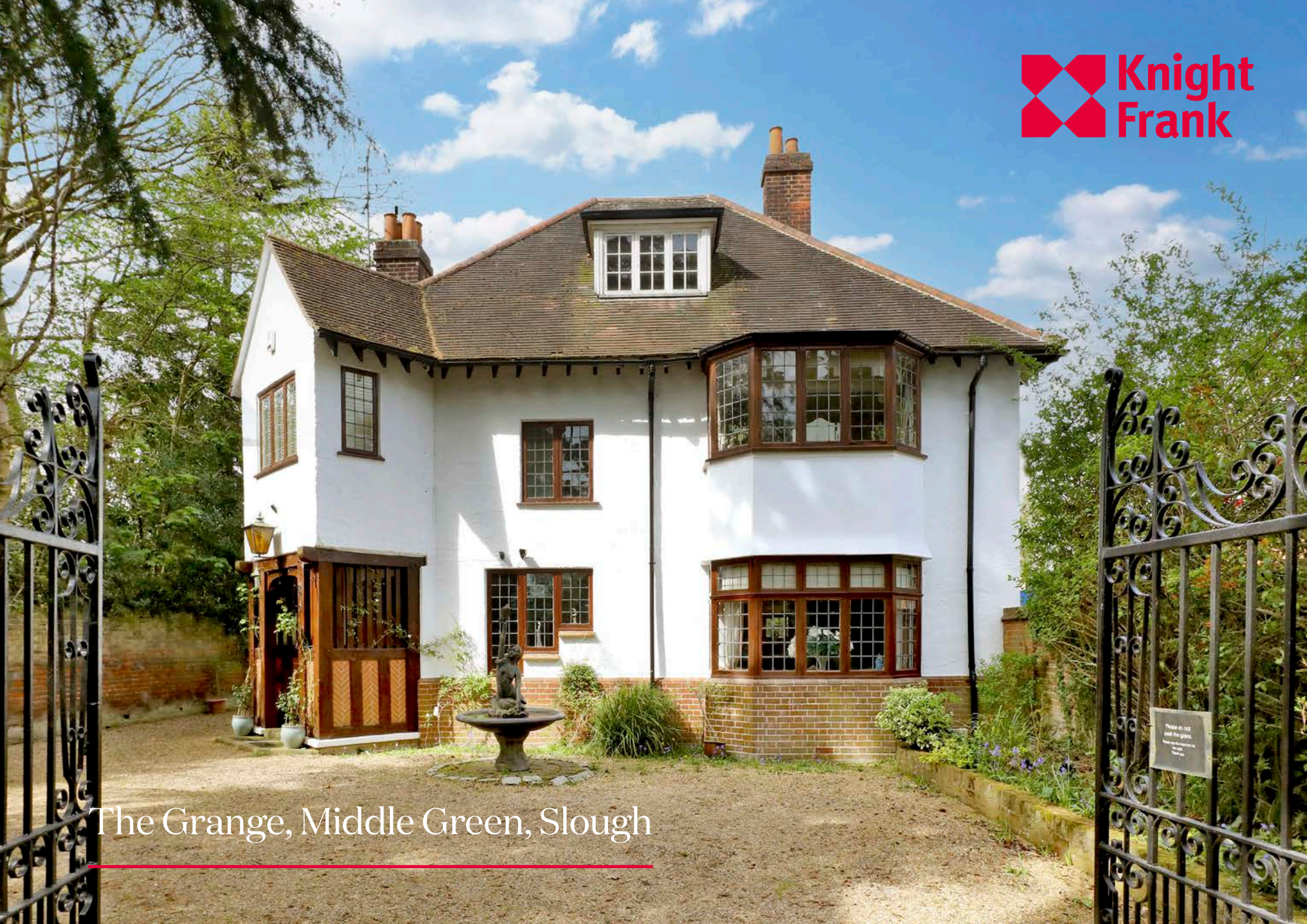
The Grange, Middle Green, Slough