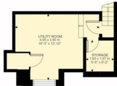
Basement 224 ft²

This plan is for guidance only and must not be relied upon as Attention is drawn to the important notice on the last page of the Particulars.