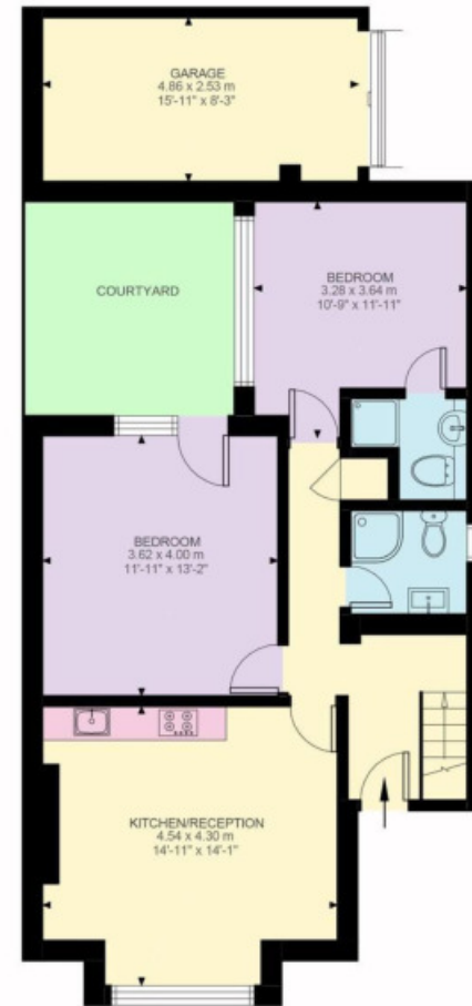
Ground Floor 654 ft 2