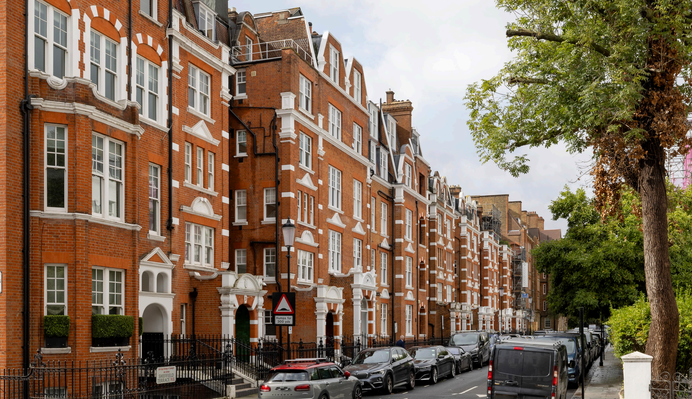
Sheffield Terrace, London W8