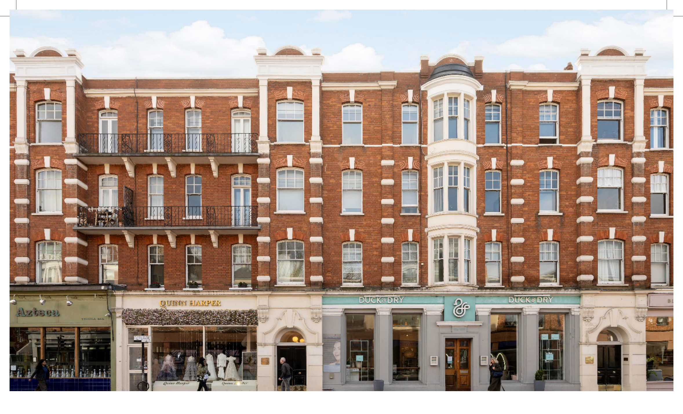
King's Road, London SW3