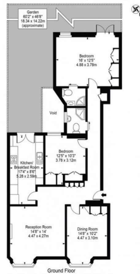
For Illustration Purposes Only - Not To Scale

Editha Mansions Approx. Gross Internal Area 1066 Sq Ft - 99.03 Sq M