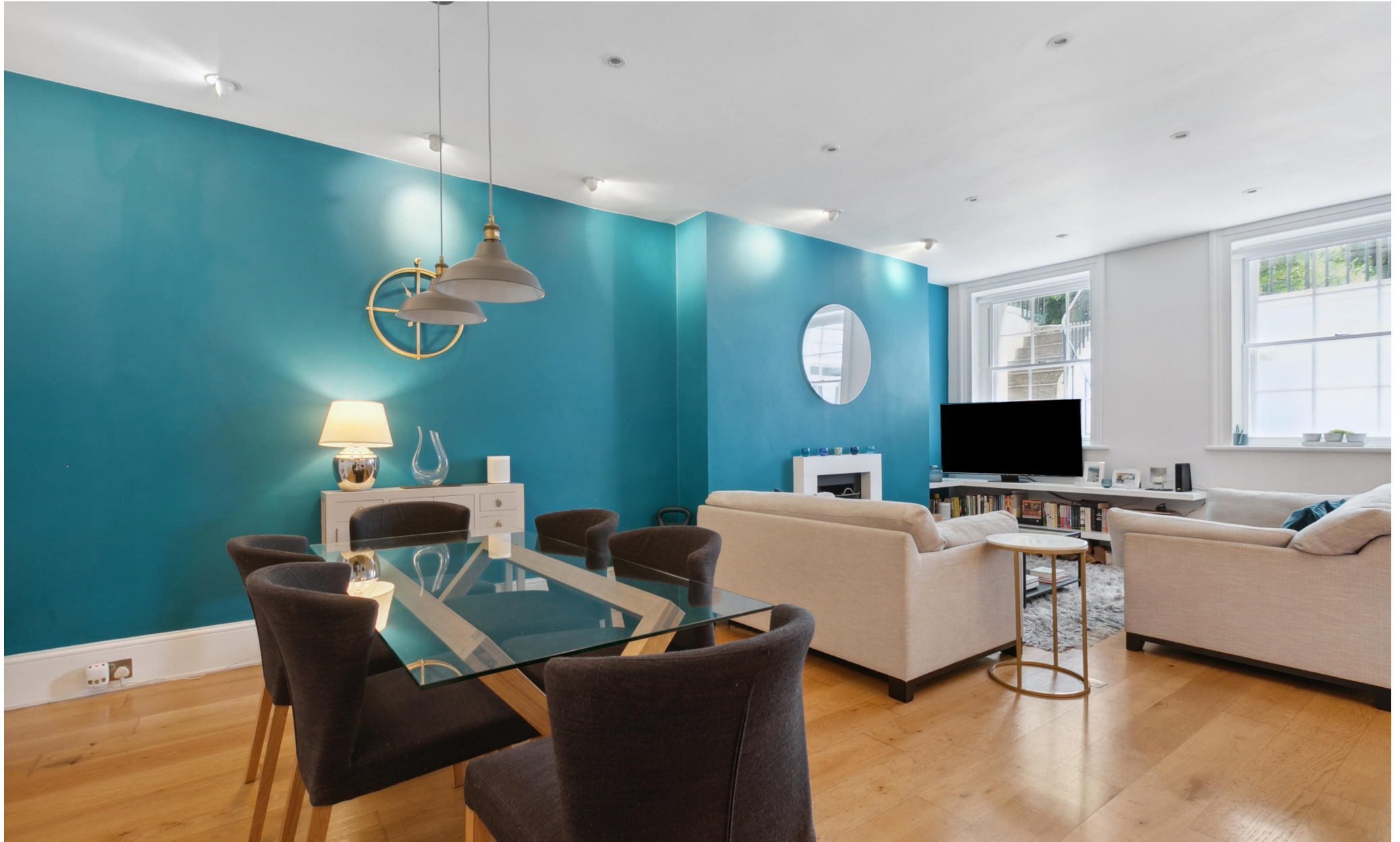
Duncan Terrace, Islington, London NI