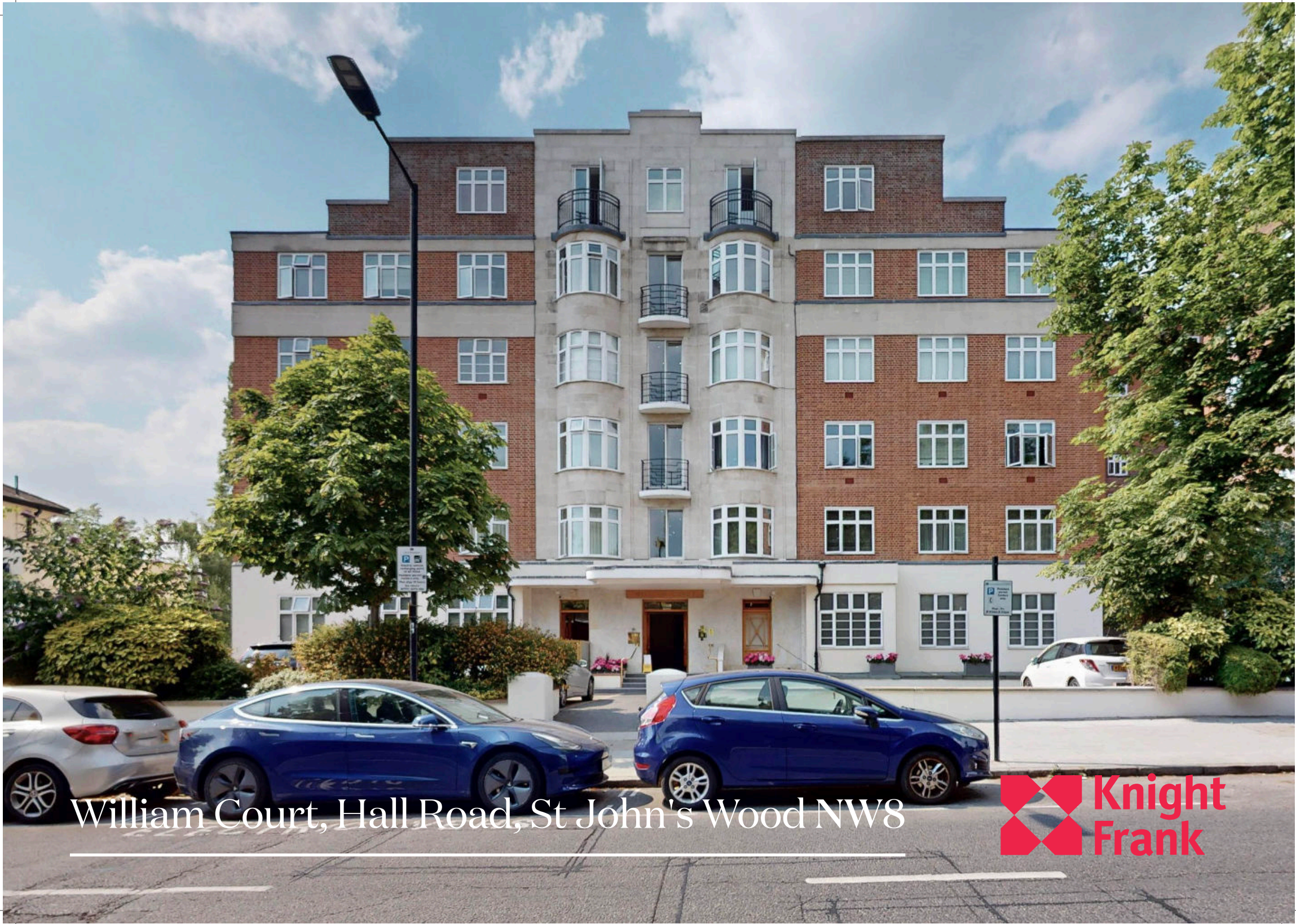
William Court, Hall Road, St John's Wood NW8