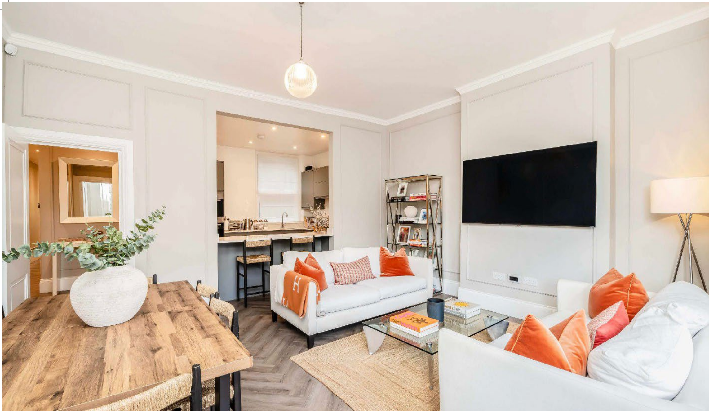
Beaufort Street, London SW3