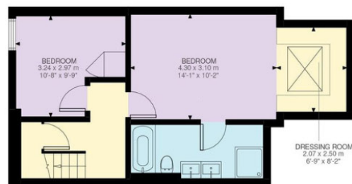
Lower Ground Floor 444 ft²