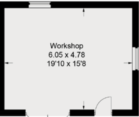
(Not Shown In Actual Location / Orientation)

Your partners in property for 125 years.