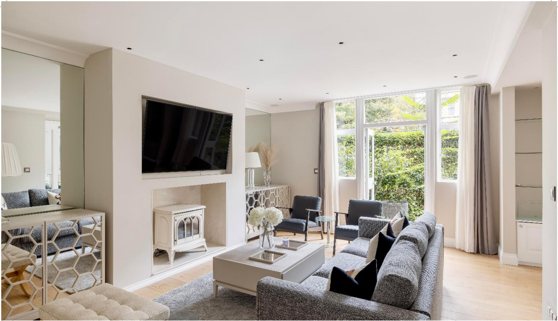
Church Close, Kensington Church Street W8