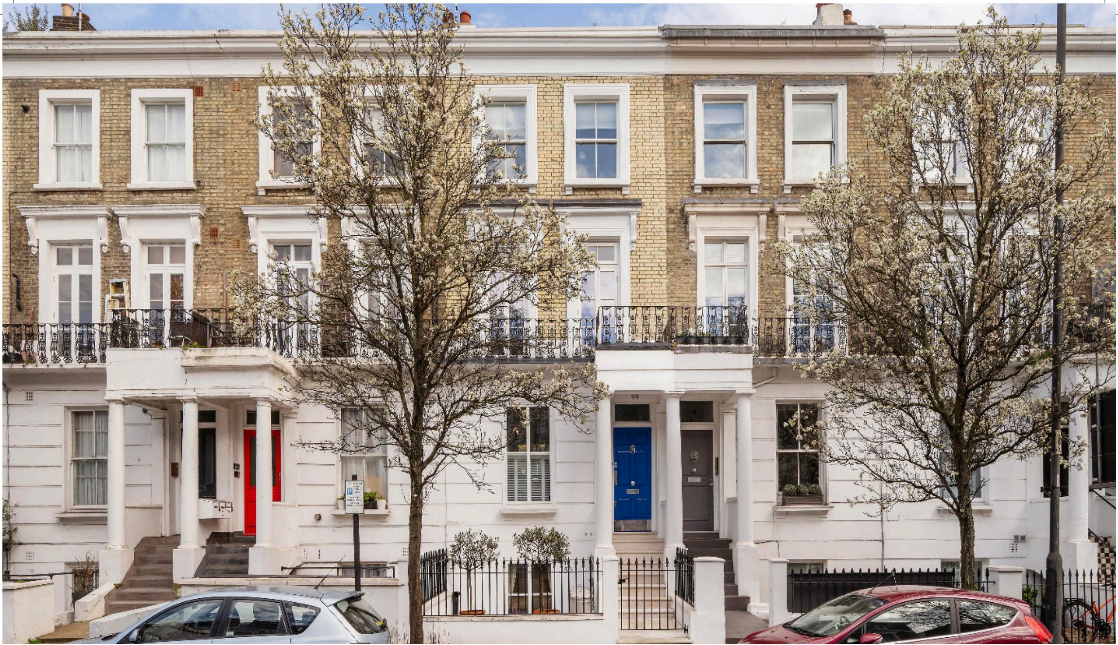
Gunter Grove, Chelsea SW10