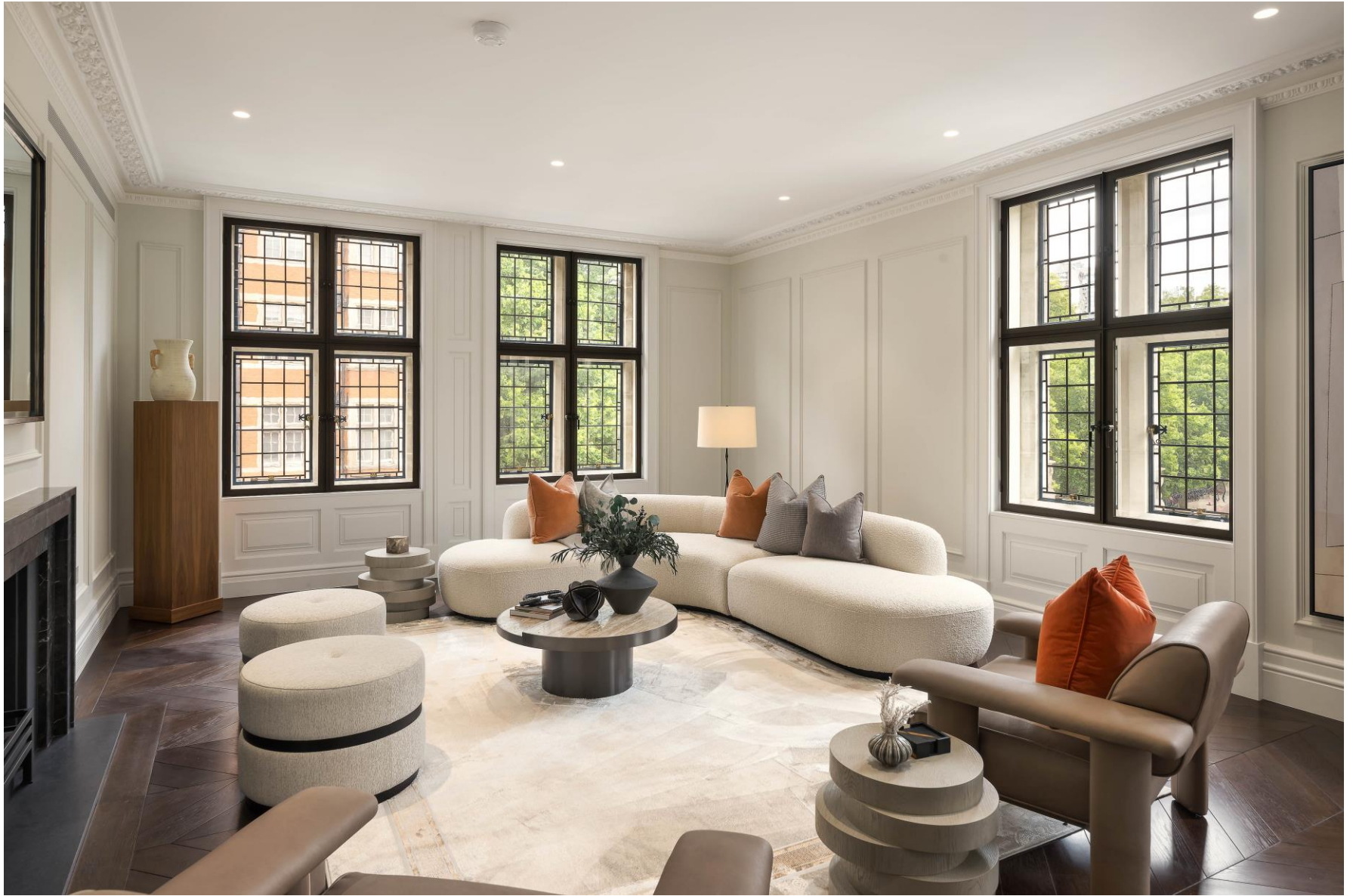
Apartment 3, 55 Knightsbridge Gate, London, SW1X 7BF