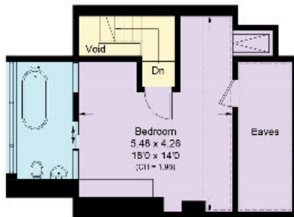
Second Floor Approximate Area = 35.5 sq m / 382 sq ft (Excluding Void) Including Limited Use Area (11.1 sq m / 123 sq ft)

Approximate Area = 192.9 sq m / 2076 sq ft (Excluding Void)