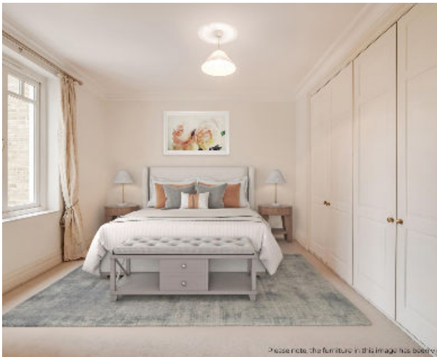
Please note, the furniture in this image has been virtually staged.