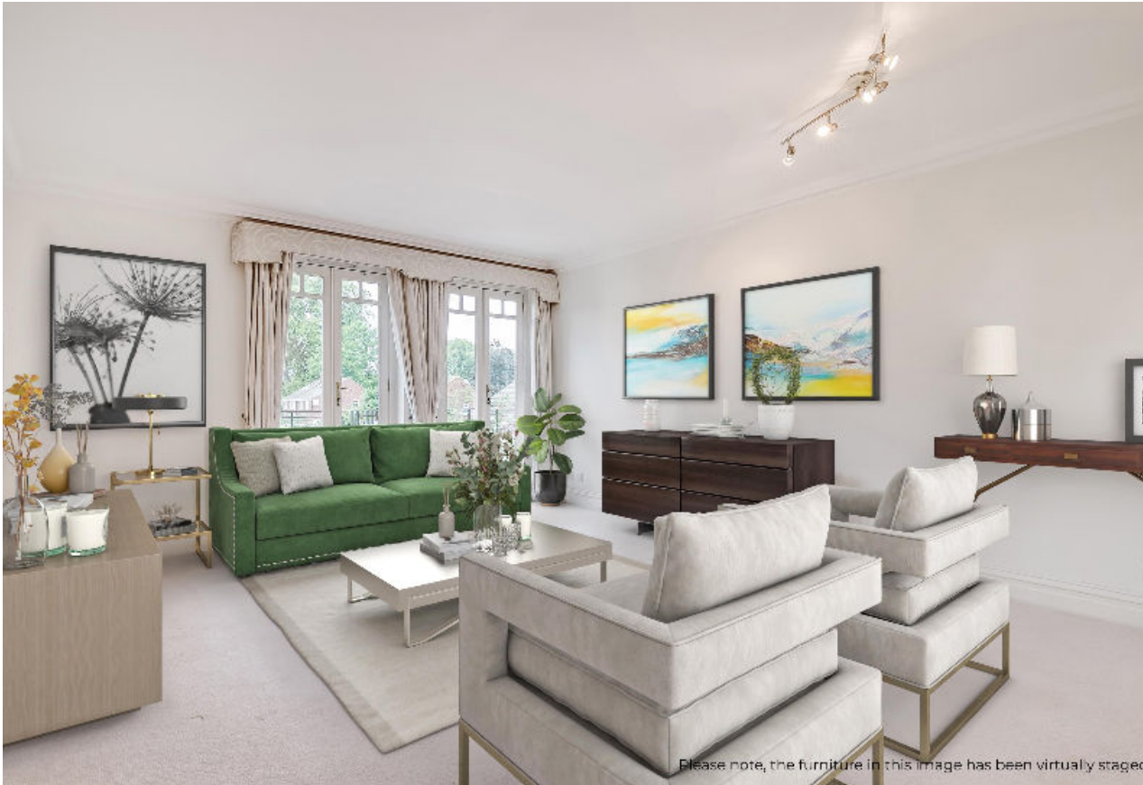
Please note, the furniture in this image has been virtually staged.