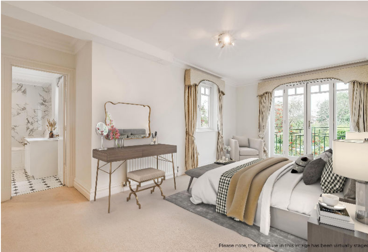
Please note, the furniture in this image has been virtually staged.