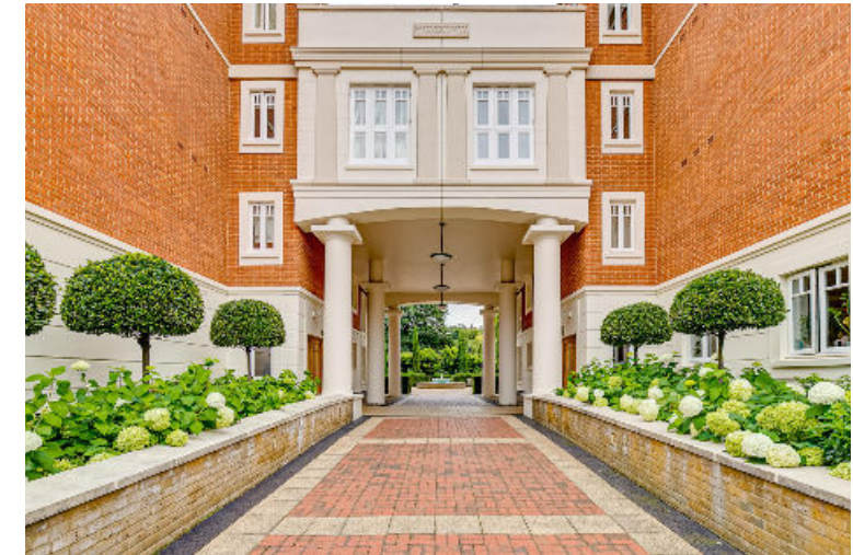
Please note that virtually staged photographs are used for illustrative purposes only.